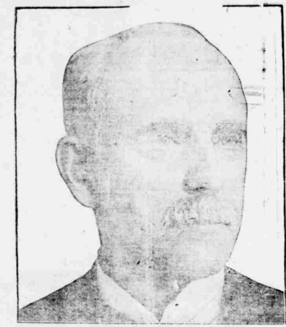
HON. LESLIE M. SHAW, EX-SECRETARY U. S. TREASURY. GREATEST STUMP SPEAKER IN COUNTRY NOW ON CHAUTAQUA