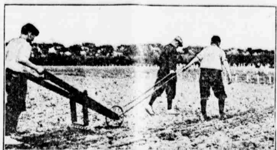
These Boys Furnish Their Own Power for Their Home-Made Cultivator.

The first step in the cultivation and care of the garden lies in proper plowing, spading and preparation of the soil. The entire seeded should be thoroughly pulverized as deep as the soil is plowed. The next step is to make sure that the rows are laid out perfectly straight and far enough apart so that when horse cultivation is employed there will be sufficient room for the horse to walk, and so that when hand cultivation is to be employed there will be room for the wheel hoe. Straight rows enable the gardener to give the crops better cultivation than would be otherwise possible.