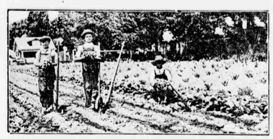
Boys Gathering the Product of Their Work, and They Are Pleased.

erly, will produce far more vegetables or three weeks' time. than the average family can consume Juring the maturing period of the crops. Only a small portion of a gar- beans have been removed. den of this size should be devoted to available the garden should be planned has killed the beans. with the definite purpose of growing crops for storage for winter use,