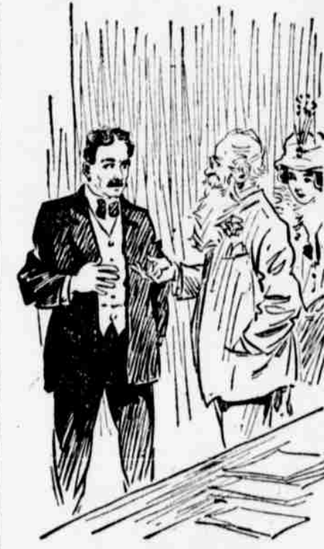
Surprised His Friends.