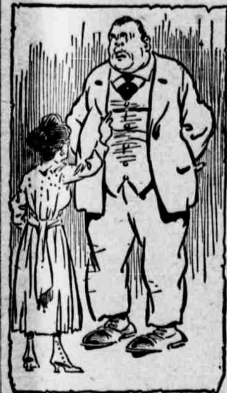
Italian and Spanish Women Have Too Much Temper.