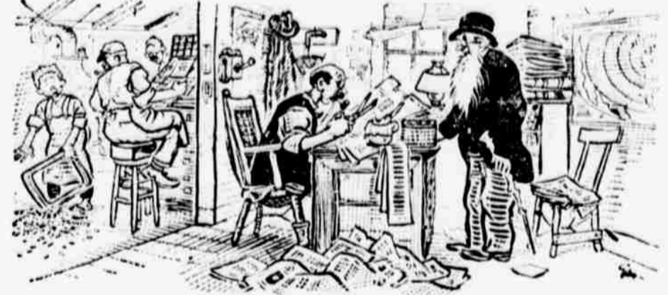
"Ther's th' Ole Chap With th' Greasy Stiff Hat an' th' Stained White Whiskers That Wants t' Look Thro' th' Exchanges for th' Dunkirk Standard."

"A Panhandle conductor has a tranquil existence when you figure up th' responsibilities of a regular editor. A editor must be a great diplomat."