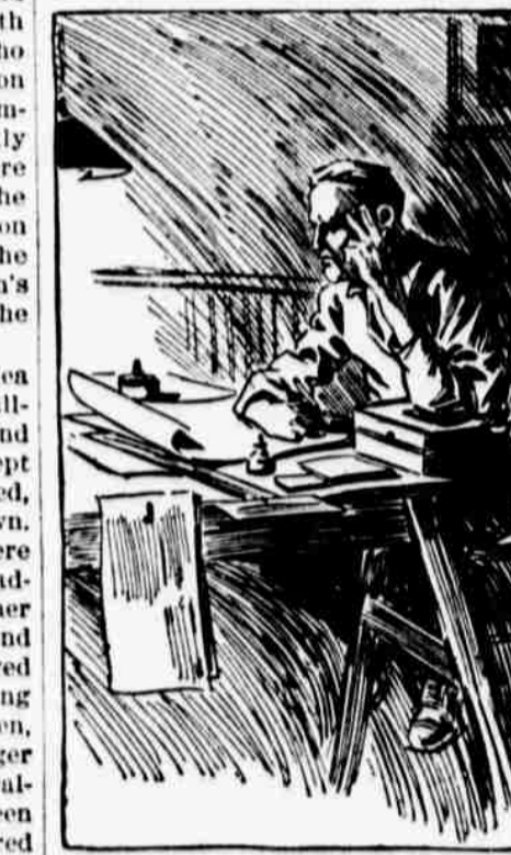
It Had Been a Part of His Life.

"That depends upon you people at the shop, doctor. If you get the stuff