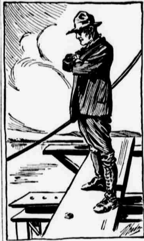
He Lingered About It.

"How you love it," said the girl. Did Meade love the bridge? Ah, there could be no doubt as to that. He had studied its growth hour by hour. As the great steel web rose, his