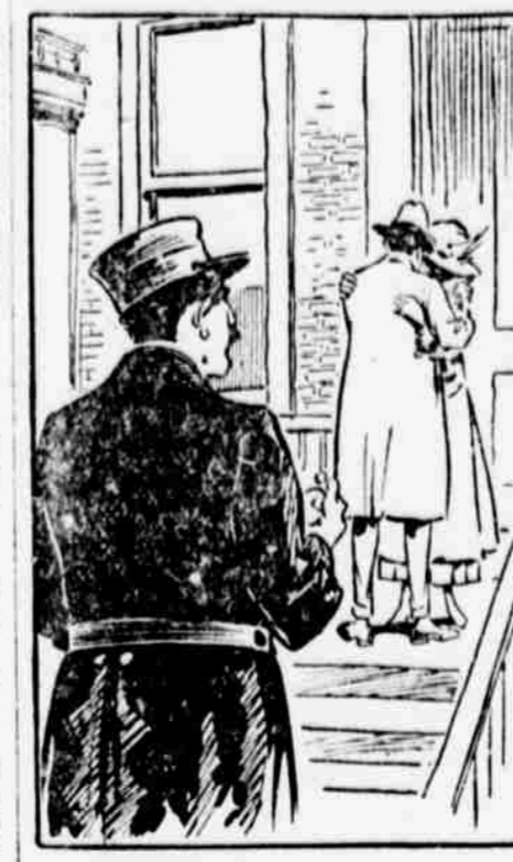
Still They Lingered.

It was too much for a mere vice squad. That's why "breach of the peace" and "kiss" became synonymous.