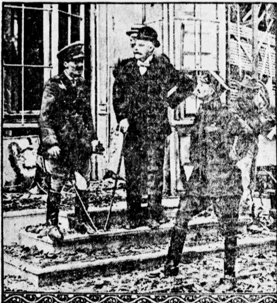
This remarkable picture, the first from captured Bucharest, shows what a Zeppelin did while on one of its raids through Roumania. The house shown in the photograph was occupied by Colonel Thompson, British military attache at Bucharest, who is shown on the steps to the left.