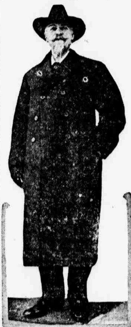
Last picture of William F. Cody, "Buffalo Bill," who died recently in Denver.

Optimistic Thought. Always at it wins the day.