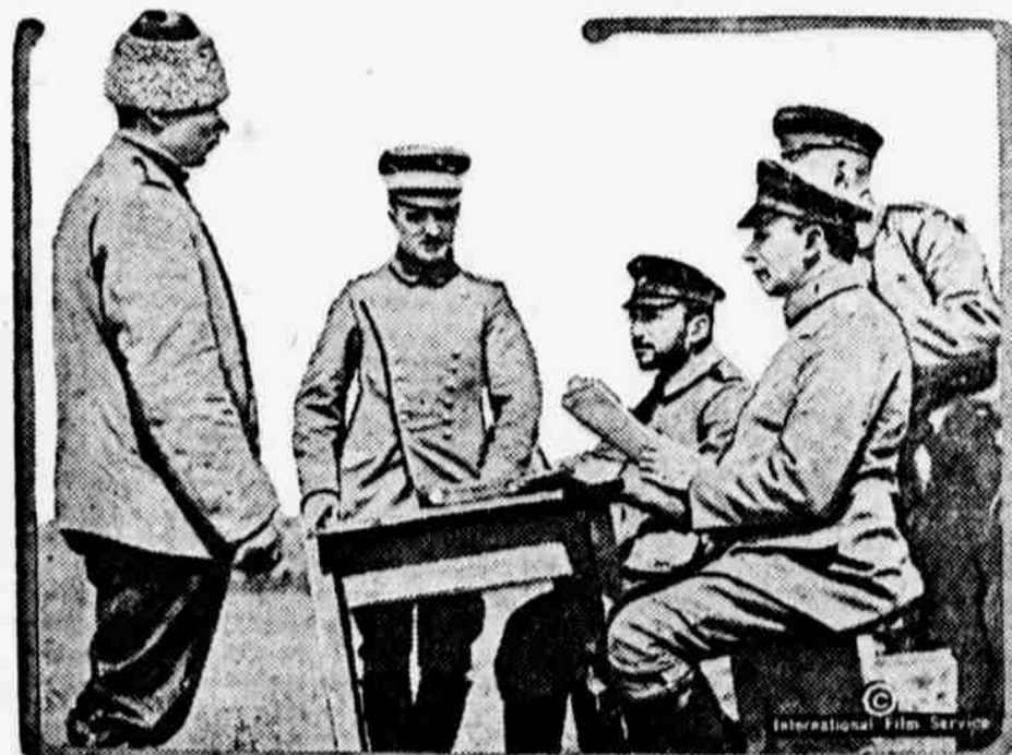
A Gallican peasant suspected of being a Russian spy being closely questioned by German officers in Poland.