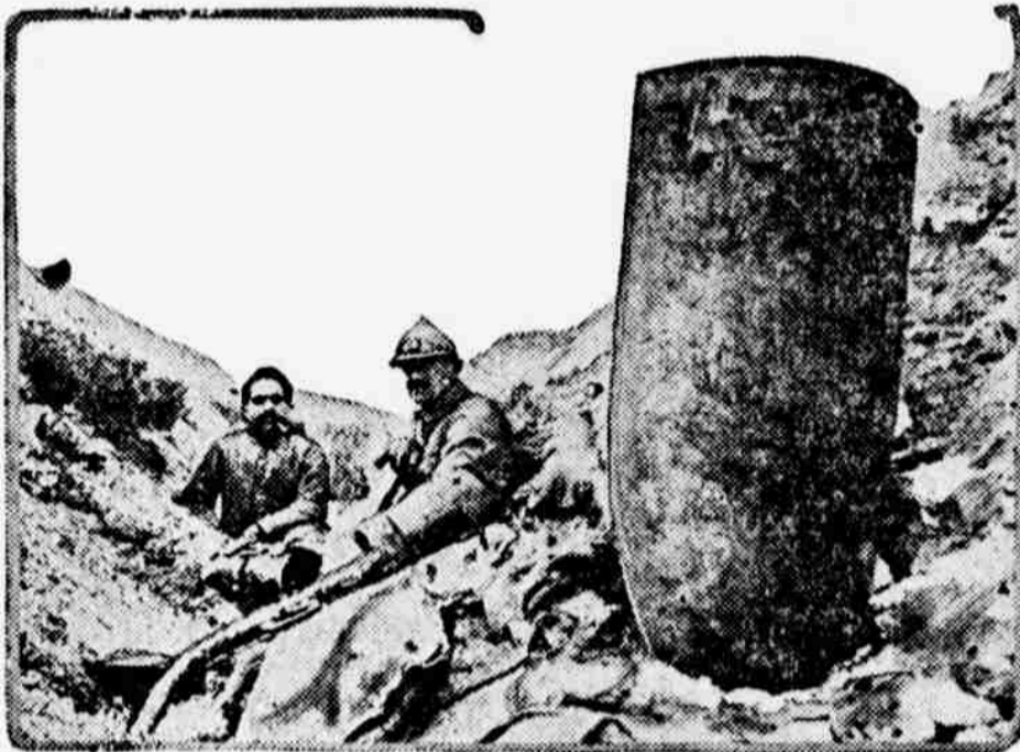
A huge shell fired by one of the German "Big Berthas," which landed unexploded in a trench on the Somme front. Had the shell exploded the two soldiers would be a mangled mass and the ground would look as if shaken by an earthquake.