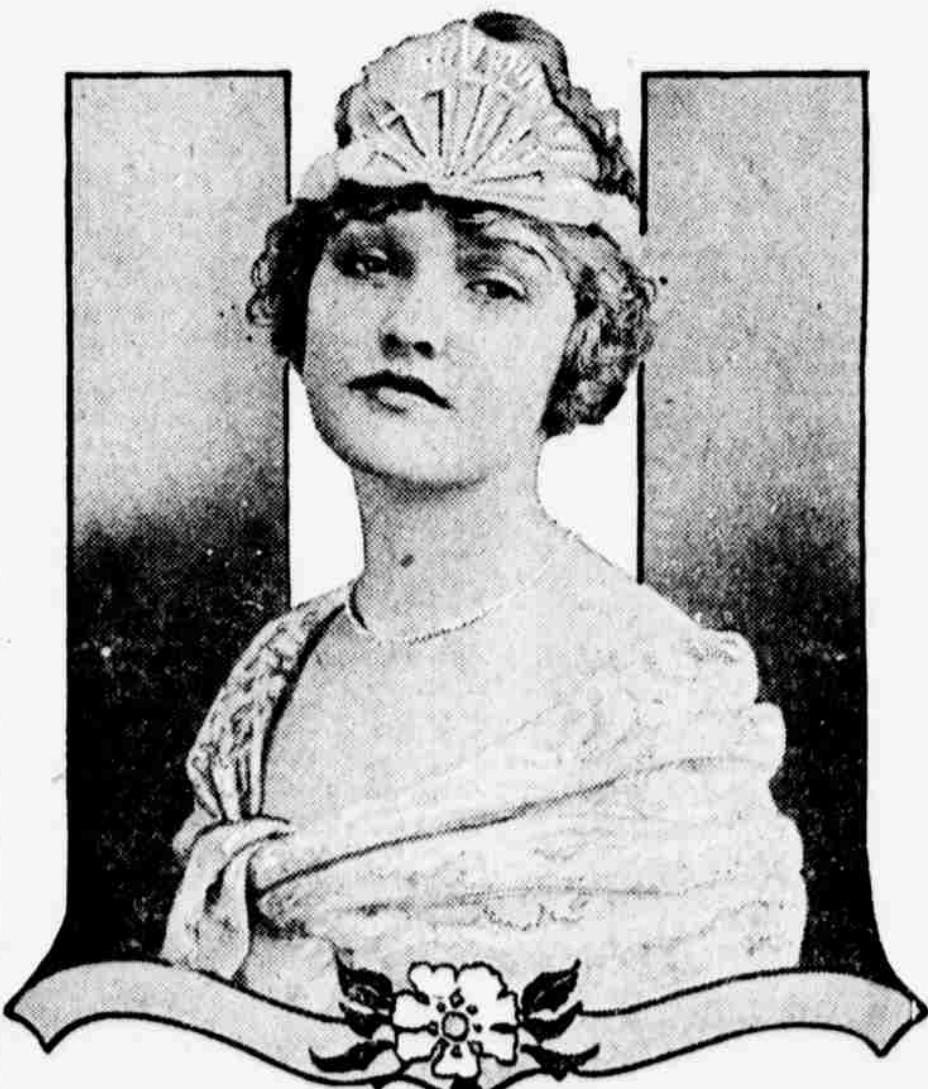
HEAD-DRESSES FOR THE OPERA.

Silver cloth and silver lace make head-dresses that are ornamented with