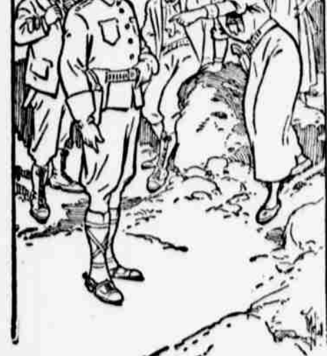
"The Whole Tribe Hates You—and I'm One of the Tribe."

The veins on Vandervyn's crimsoned forehead were swollen and pulsating with his furious anger. He spoke in