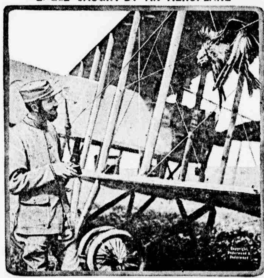
An unusual photograph of an eagle caught in a French aeroplane, hanging by his wings on the wires of the framework of the machine. The eagle was probably trying to attack the aviator when his wings were caught in the wires.