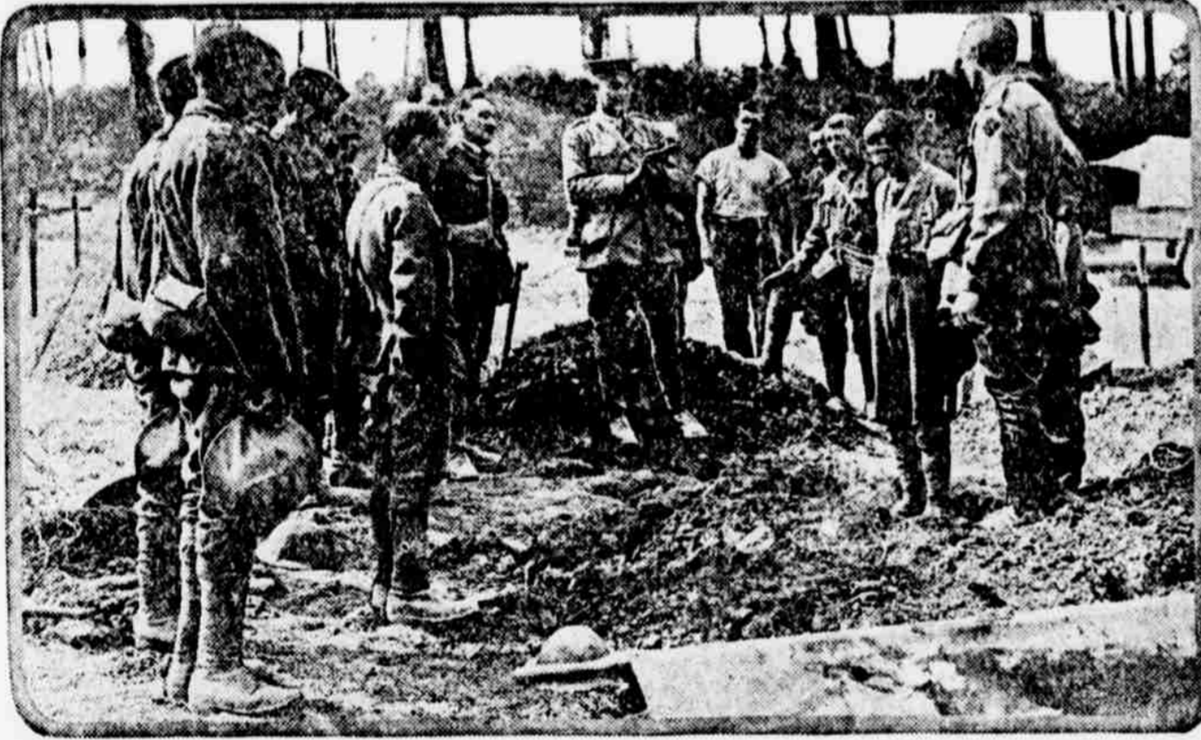
This official photograph, taken during the British advance in the west, shows the burial of an Anzac man killed in battle. These troops from Australia and New Zealand, who fought bravely in Gallipoli, are making a great record on the western front.