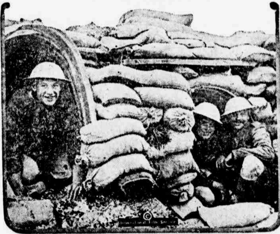
In the recent British advance on the western front the British captured many German trenches of unusual construction. The trench shown here is evidently a product of German efficiency as shown by the ready-made steel guards. Hugely as the British soldiers shown are enjoying themselves, they have not neglected to don their steel shrapnel-proof helmets.