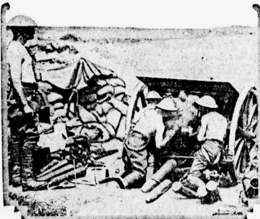
This shows one of the smaller guns in action during the British offensive on the western front. There is not a minute's let-up in the work of the moulder guns. It is a hot job for a summer day.