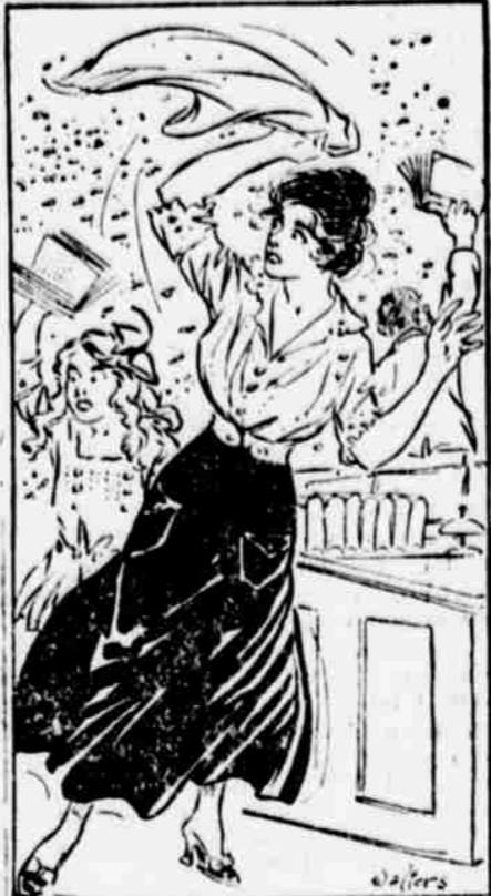
Did Battle With Whatever Weapons They Had Handy.