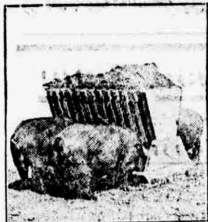
Alfalfa Rack in Use.

Corn is being grown successfully in the East, and in some sections the average yield per acre is greater than that of the middle West.