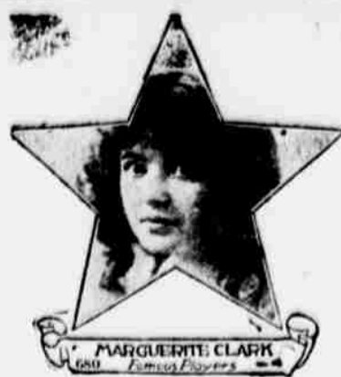
In Girl of the Golden West, Paramount Program, at the Tepee, Monday, April 24. One day only.