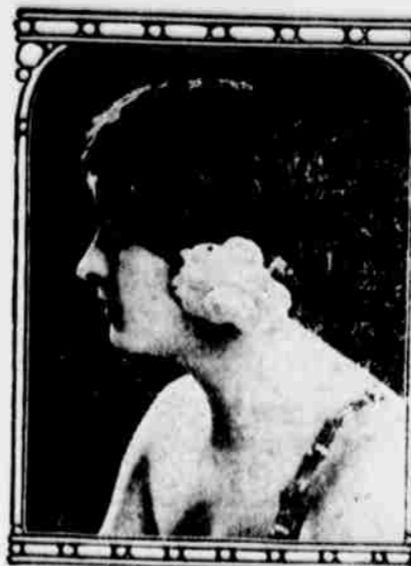
CLARA KIMBALL YOUNG DIRECTION OF WORLD FILM CORPORATION

She had money, jewels, everything—but where did they come from. He loved her—suspected, yet wanted to marry her. The Count, too, wanted her, but in a different way. What happened—who finally succeeded in getting Clara Kimball Young in "Camille" to be shown on the opening night, Wednesday, March 1st at the Orpheum.