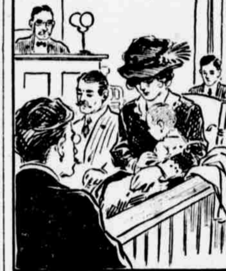
Sat Upon His Mother's Lap During the Trial.

Wear th' smile o' optimism, even if it does make you look like a young widower.