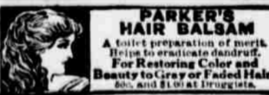
PARKER'S HAIR BALM. A toilet preparation of merit. Trips in eradicate dandruff. For Restoring Color and Beauty to Gray or Faded Hair. 50c and $1.00 at Druggists.

Now Sold in Tablet Form if Desired. CATARRH IS STAGNATION