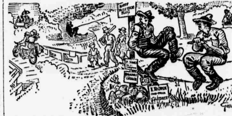
"Th' Thirst fer Pleasure Has Long Since Infested th' Broad, Profitable Farms o' th' Countryside, an' th' Tanned an' Brawny Sons o' th' Wealthy Farmer Perch Dejectedly on th' Barbed Fences an' Sigh fer th' Congested City With Its Smells an' Tribulations, While His Daughters Droop an' Fade at th' Prospect o' Endin' Ther Days So fer Removed From th' Centers o' Danger an' Merriment."