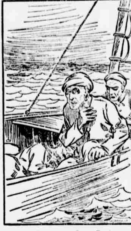
At Sea In an Open Boat.

It seems that the men belong in Menado and had been to Saugier on