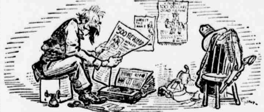
"I Wouldn't Be Surprised if Ever' Hoss Thief Kept a Scrap Book an' Ever' Burglar Buys a Mornin' Paper Fer Ther's a Hankerin' Fer Publicity Even Among Thieves."

Some folks have publicity thrust upon 'em while others walk right int' th' newspaper office an' personally su-