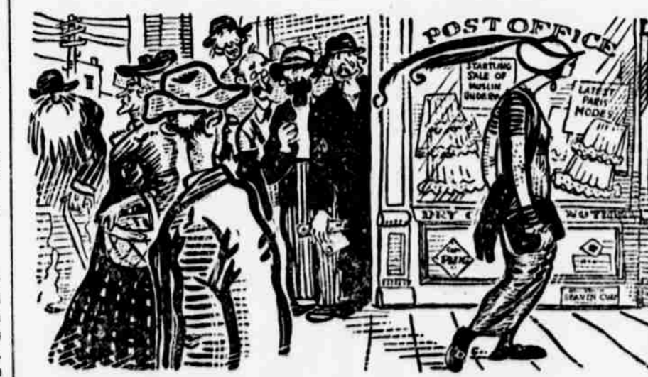
"Those o' You Whose Memories Kin Go Back t' th' Muncie Roller Skate Must Be Appalled When You Stand on th' Post Office Corner Any Afternoon. Rain er Shine—Rain Preferred—an' Note th' Progress Degeneracy Has Made Since Those Stirrin' Days o' th' Early Eighties."

"One o' th' most remarkable things t'day t' my notion, is how a man in th' full possession o' his faculties can keep his mind on his business when he looks about him. I wish t' say,