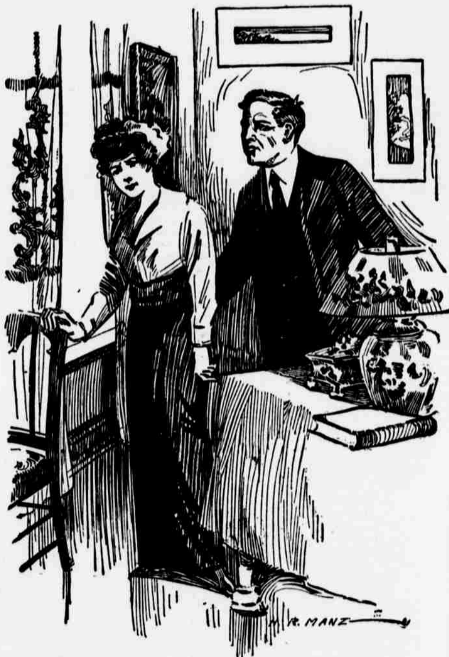
"Love," He Told Her, "Does Not Come at Our Volition."

The years slipped gently by, and The Little Maid became a woman