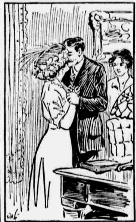
Lavished Kisses Upon the Sisters.

She also accused the conductor of having beaten her five times after she had remonstrated with him for break-