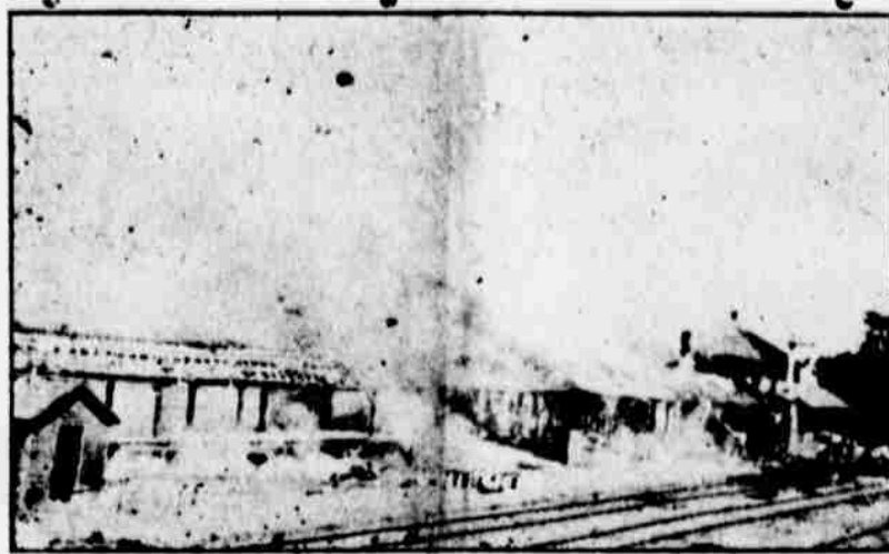
FIRE AT C. B. & Q. DEPOT LAST WEDNESDAY

WEBSTER COUNTY BANK, RED CLOUD, NEBRASKA CAPITAL $25,000