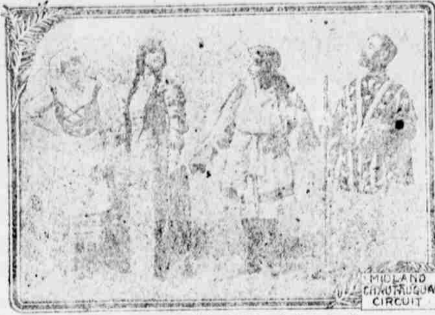
Shakespeare—Don't be frightened—he's dead! "Twelfth Night"—Sit up—got interested! Love's Labor's Lost—LAUGH!