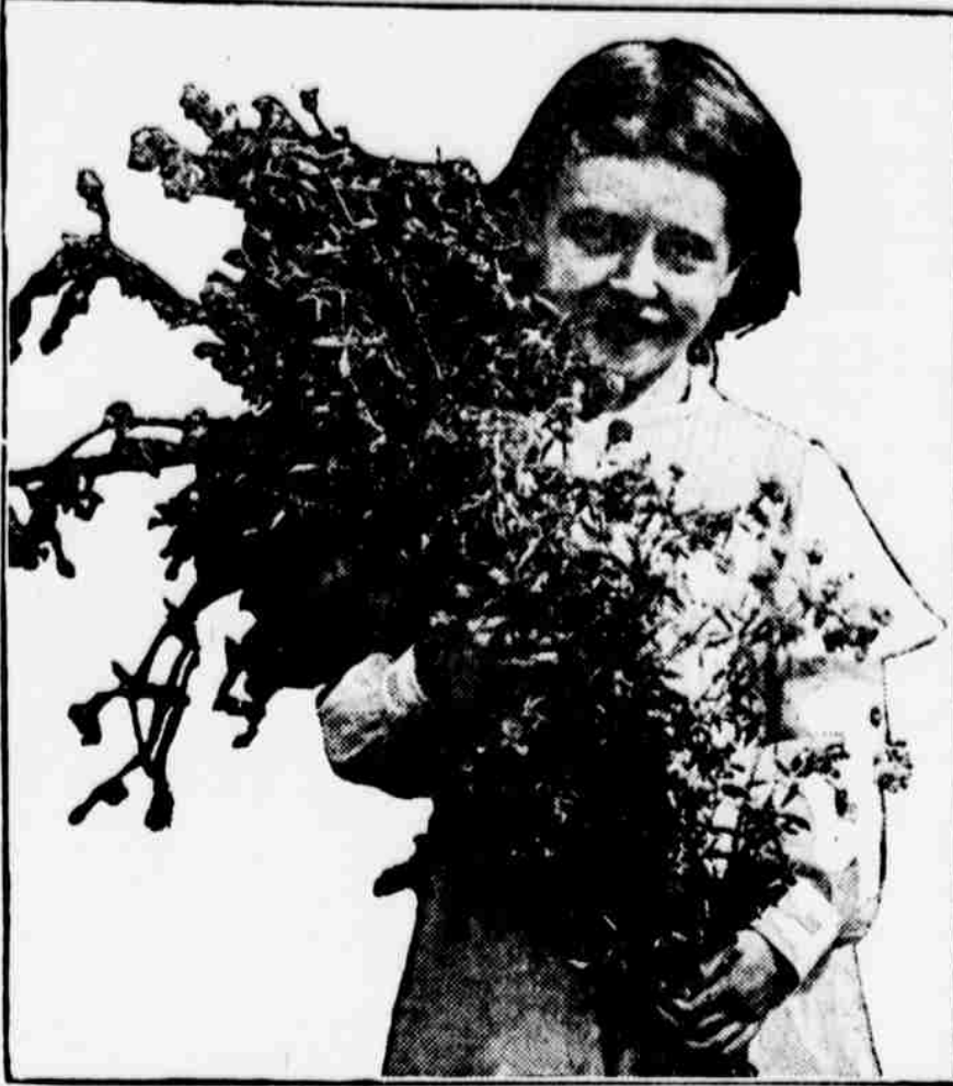
A Nice Bunch of Alfalfa.

(Prepared by the United States Department of Agriculture.)