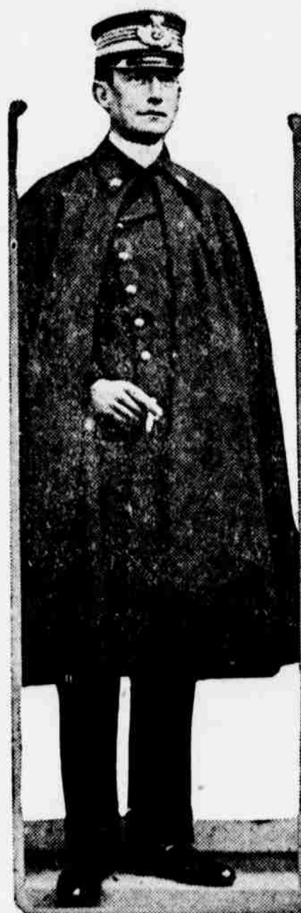
The duke of the Abruzzi is commander-in-chief of the naval forces of Italy.