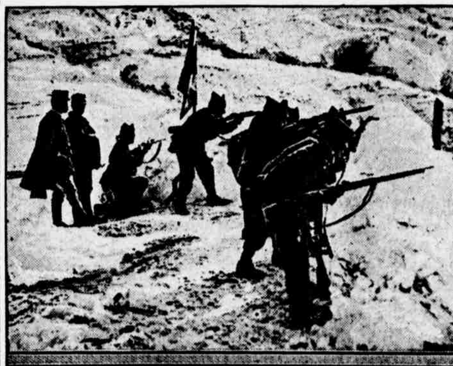
Alpine regiment of the Italian army behind a snow barricade on the Austrian frontier.