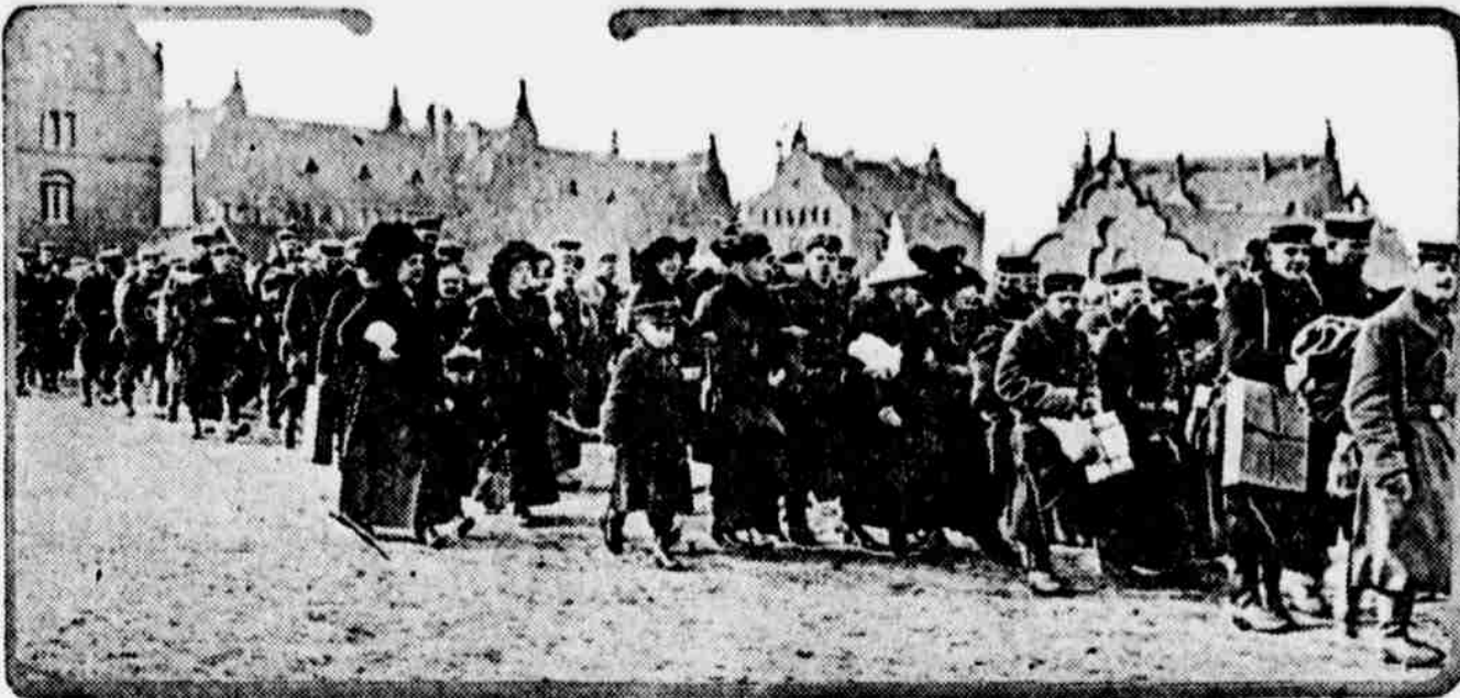
Members of the German landsturm, recently called to the colors, on their way to a station in Berlin to entrain for the front and accompanied by mothers, wives and sweethearts.