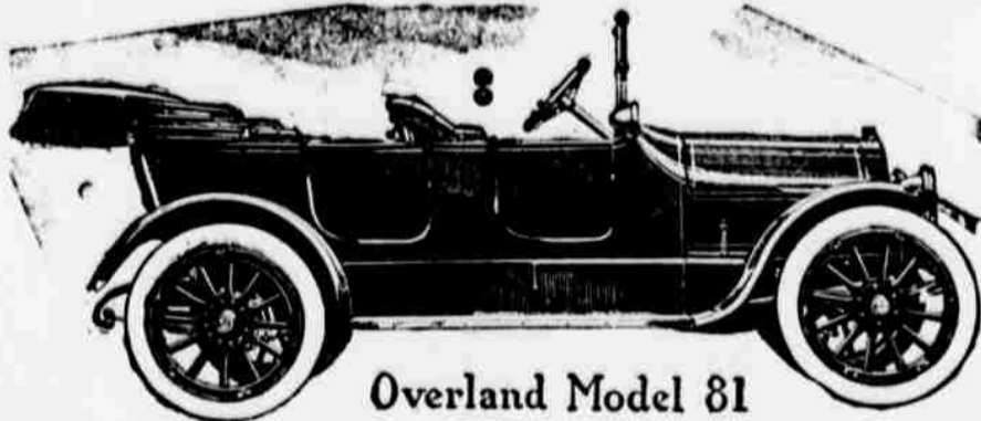
Overland Model 81