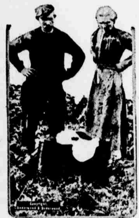
Pathetic scene of Belgian peasants caring for a dying French soldier after his regiment has passed on.

to arrive in Bruges throughout yesterday."