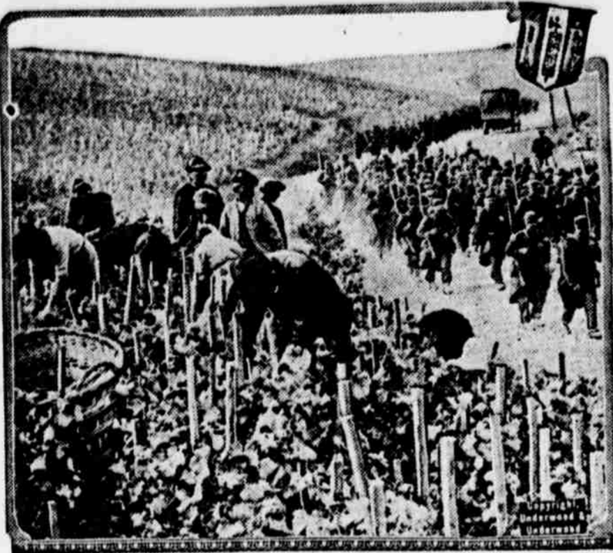
French troops marching through a valley of the champagne country, where the peasants are picking the grapes for the famous sparkling wine.

tween the sea and the inundations, but they were easily repulsed.