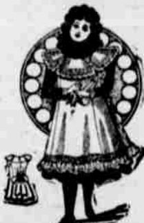
1861—GIRLS' APRON. Sizes 4, 6, 8, 10 years.

NEW IDEA PATTERNS EXCEL. ANY SIZE ANY STYLE, 10cets.