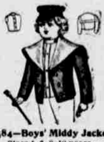
1484—Boys' Middy Jacket. Sizes 4, 6, 8, 10 years.

These patterns are proving a great success.