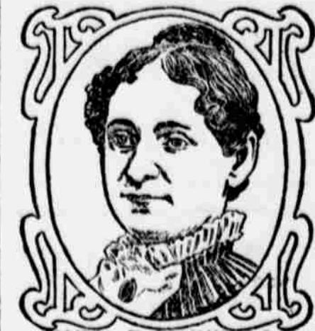
LYDIA E. PINKHAM

No other medicine has been so successful in relieving the suffering of women or received so many genuine testimonials as has Lydia E. Pinkham's Vegetable Compound.