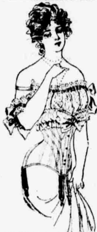
AMERICAN BEAUTY Style 786 Kalamazoo Corset Co., Makers.

Long sleeve and close fitting at the knee, union suit, at..... 25 to 50c Long sleeve Vests in gauze at..... 15 and 25c Knit Pant at..... 25c Sleeveless Vests at..... 10 to 25c