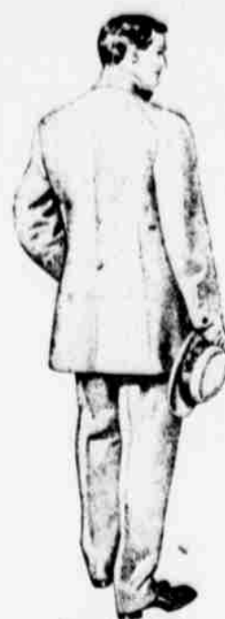
Copyright 1907 The House of Kuppenheimer Chicago