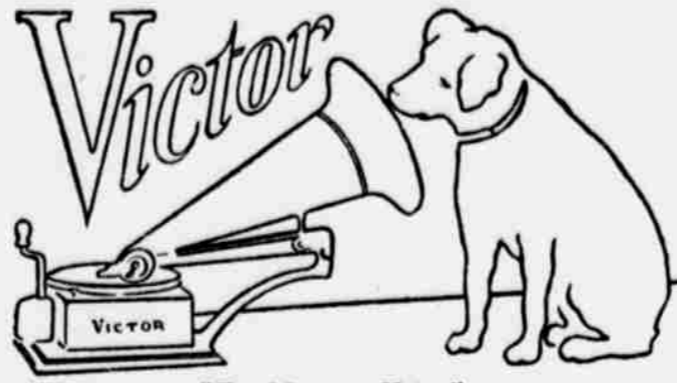
"His Master's Voice"