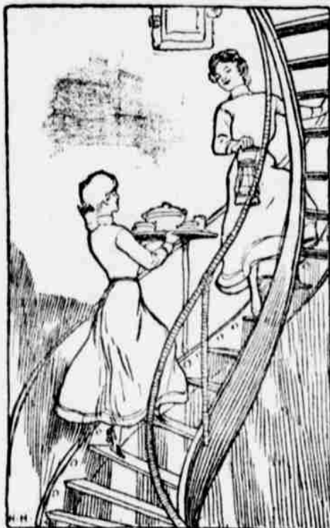
They were cheerful as grigs over it.

He was making new entries in the weather report when she remarked thoughtfully: