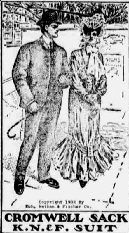
CROMWELL SACK K.N.E.F. SUIT