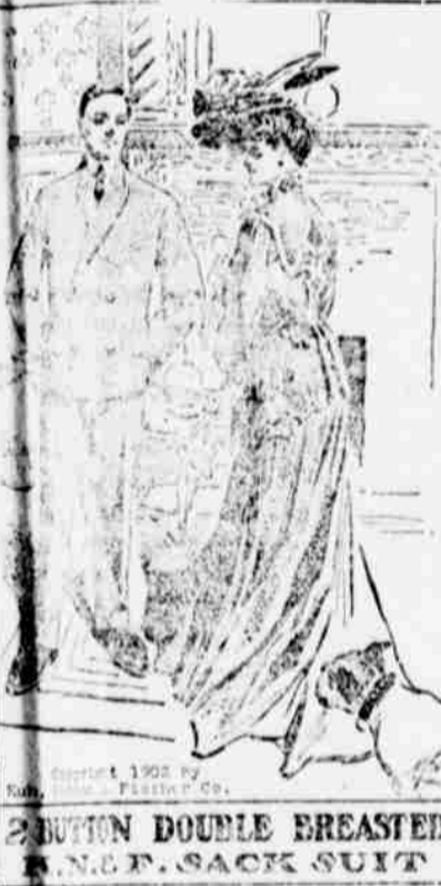
DOUBLE BREASTED K.N.E.F. SACK SUIT