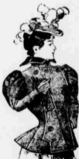
Ladies' black beaver jacket, Fine quality, Sale price 5.00