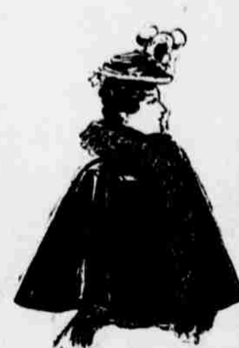
Ladies' fine Mohair Boucle cape, full sweep, full silk lining, trimmed with Thibet fur 9.00

Men's Duck Coats a fine bargain 95c. Worth $1.25.