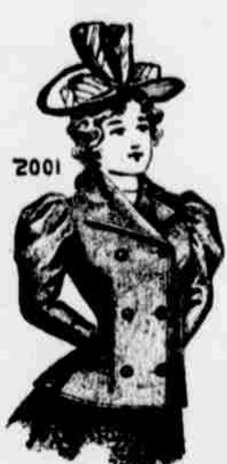
2001 Children's Jacket, fancy light brown check, trimmed with braid, 4.00