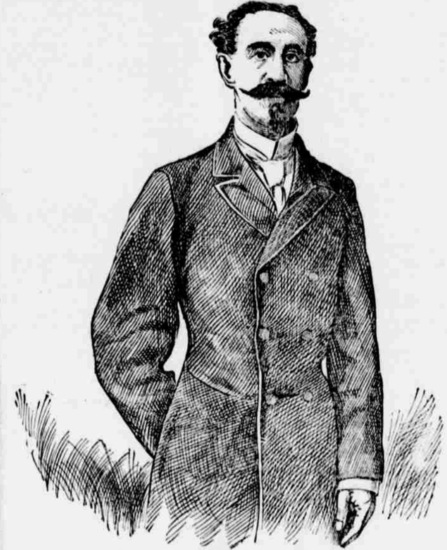
THE LATE PROFESSOR HERRMAN.

and a great favorite of the Sultan of Turkey, who was wont to send for him and pay him a princely sum for a single entertainment. Carl Herrmann, Alexander's elder brother, also achieved great fame in the world of magic.