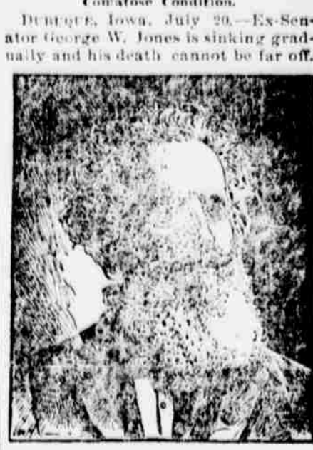
GEN. GEO. W. JONES.

Most of the time he is in a comatose condition, but rallies at intervals, when his mind seems to be as clear as ever.