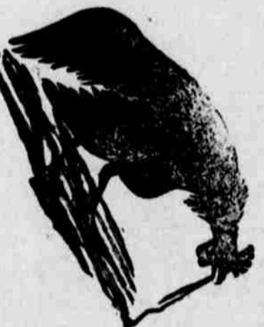
This Rooster Went Down Hill.

"Great Lord, give us leather lungs, that we may yell with a loud and boisterous noise; amplify our throats that the passageway of noise may meet with no incumbrances; this being one great jag of joy, make it not the less but rather multiply it and the facilities for making it." This was the prayer of a man with a tin horn who sat on the corner at midnight, and heard the returns, announcing that the republican candidates were being elected by majorities that were weird and wonderful. For the last few weeks the campaign has been on, and it waged warm. THE CHIEF, as it has always done, fought the republican battle faithfully and unflatteringly, doing what we thought was right, and lived in hopes of winning the battle in its entirety, but the fortunes of war are often fickle, and disappointment comes with success. In