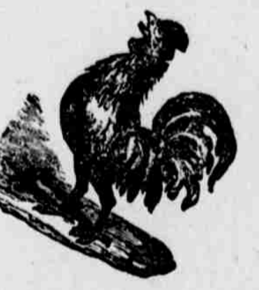
This Rooster Went Up Hill.