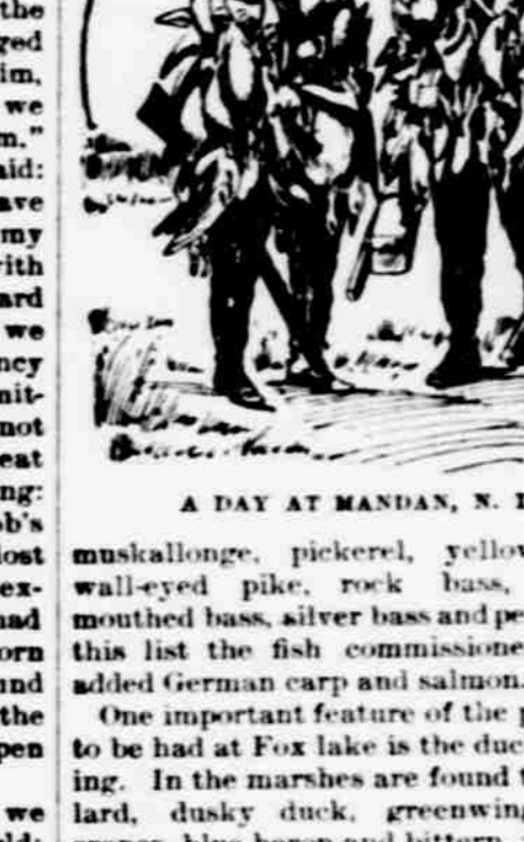
A DAY AT MANDAN, N. D.

Watch Out. Slicker. Will Not Peel or Stick. Soft Woolen Watch Out Collar.