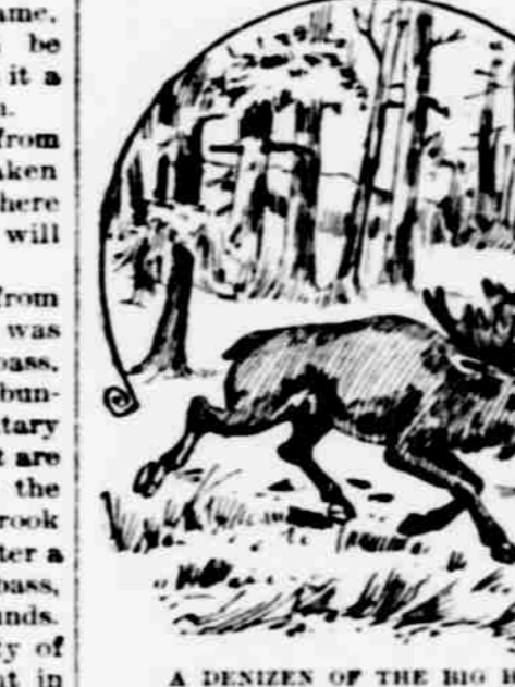
A DENIZEN OF THE BIG HORN.

How many unuttered troubles! No human ear has ever heard the sorrow. O, troubled soul, I want to tell you that there is one who can cure the wounds of the heart, and that is the savior Jesus.