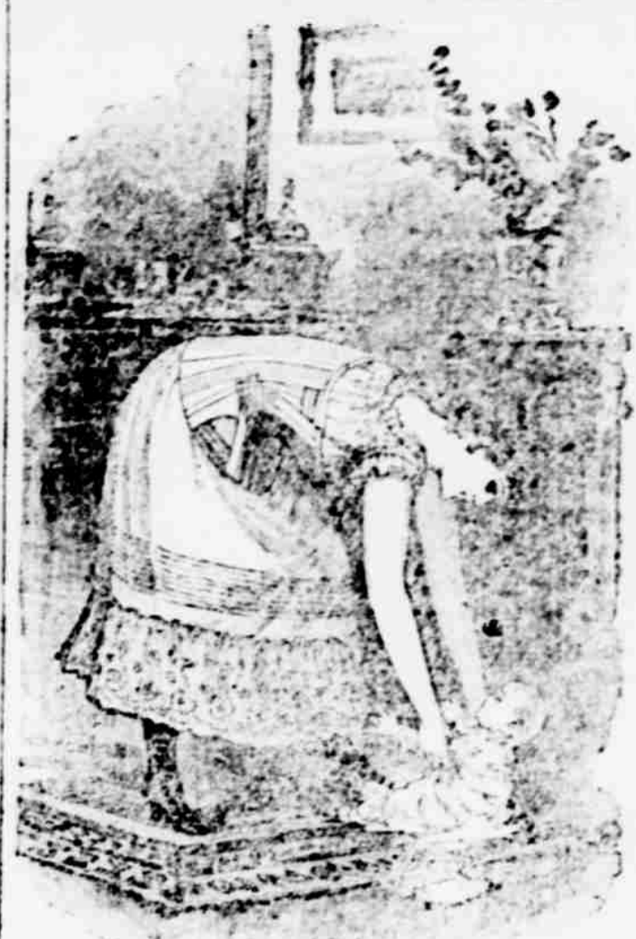
Easy to pick Baby up when he tumbles!