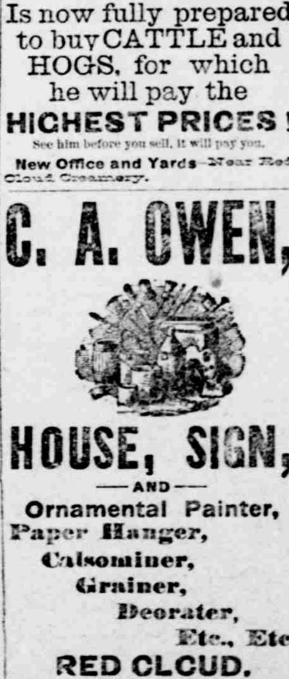
House, Sign, Ornamental Painter, Paper Hanger, Cabinetmaker, Grainer, Decorater, Etc., Etc. RED CLOUD. Orders solicited. Prices reasonable and all work guaranteed.