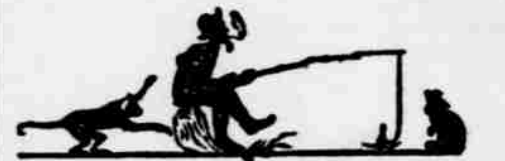
This space is owned by BLACKWELL'S BULL.

Tell the children to cut out and save the comic silhouette pictures as they appear from issue to issue. They will be pleased with the collection.