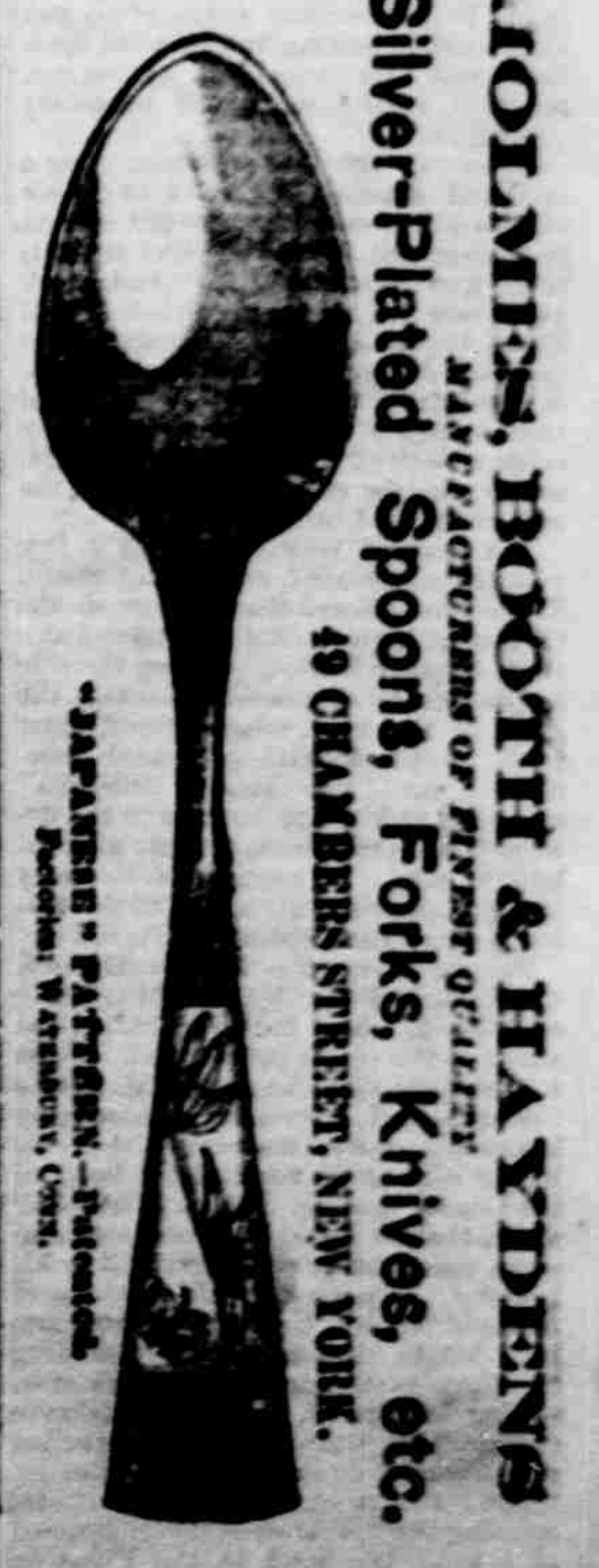
SILVER-PLATED SPOONS, FORKS, KNIVES, ETC. 49 CHAMBERS STREET, NEW YORK.

H. E. PAINT & OIL CO., 7 INDIA ST., BOSTON, MASS. Selling Agents for Hartman's Oil. Ask for Brass, Copper, Composition, &c.