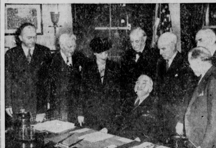
The American delegation to the United Nations conference in San Francisco meets with President Harry S. Truman at the White House. L. to R.—Comdr. Harold Stassen, Rep. Charles Eaton, Mrs. Virginia Gildersleeve, Sen. Tom Connally, Secretary of State Edward Stettinius, Sen. Arthur Vandenberg, and Rep. Sol Bloom. President Truman, seated.