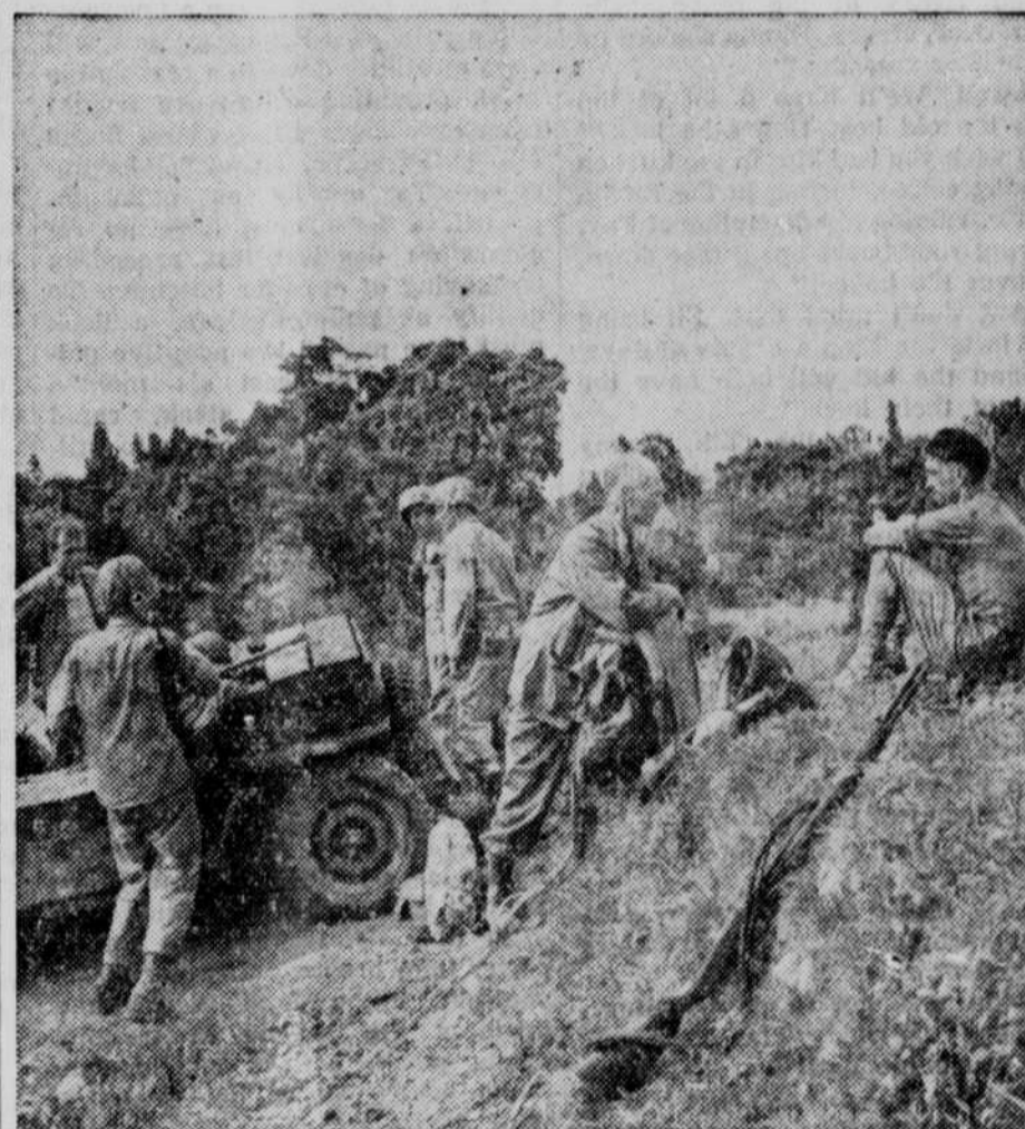
Ernie Pyle, famous war correspondent, acclaimed as the fighting men's personal reporter, recently killed by a Jap machine-gun bullet on a little island off Okinawa, is shown in his last photo. This is typical of the way he covered both wars, by living and working with the men. He escaped death several times while covering the war with Germany.