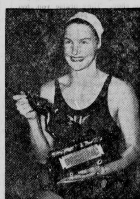
Ann Curtis, San Francisco swimmer, who has been chosen as the one who, by performance, example and influence as an amateur athlete, did most during 1944 to advance sports.