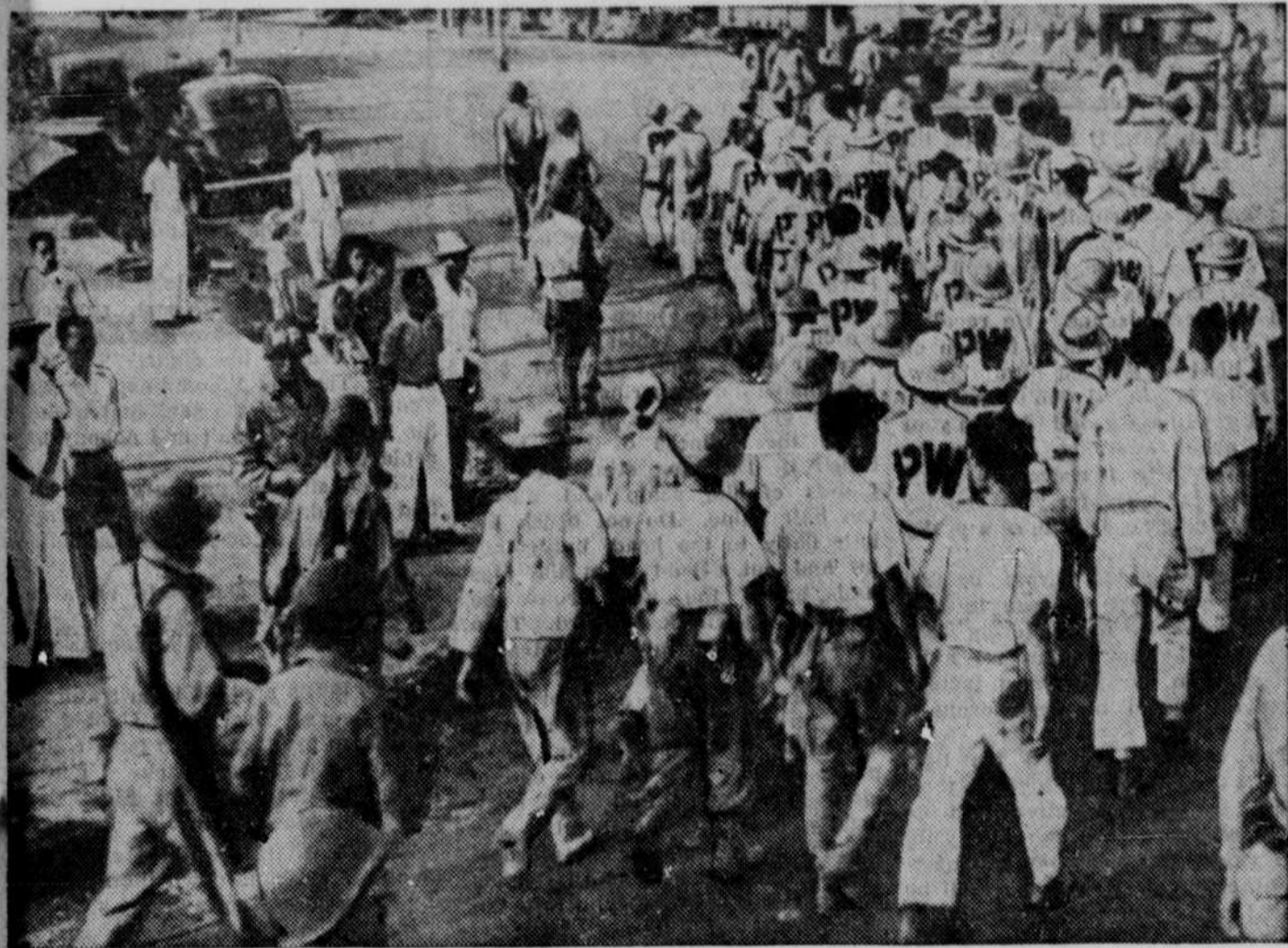
Identified by the letters "PW" printed on their backs, Japanese prisoners of war march down Rizal avenue, Manila, P. I., on their way to their daily work of clearing debris and rubble, helping to rebuild the city which they tried so hard to destroy. American policemen, with rifles ready, escort the Jap workmen to their task.