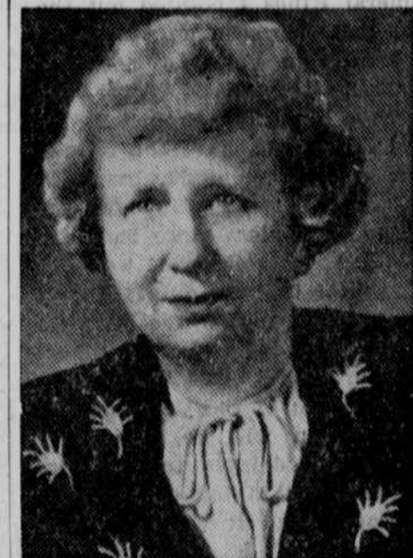
Recent photograph of Mrs. Harry S. Truman, wife of the 33rd President of the United States and first lady of the land. Mrs. Truman has been active in war relief work and states that she is not and will not be active or interested in politics.