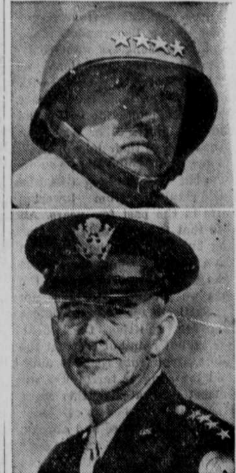
Lt. Gen. George Smith Patton Jr., commander of the 3rd army, top, and Lt. Gen. Courtney Hicks Hodges, commander of the 1st army, who have been promoted to rank of full generals. Their elevation to rank of four-stars was suggested by senate committee.