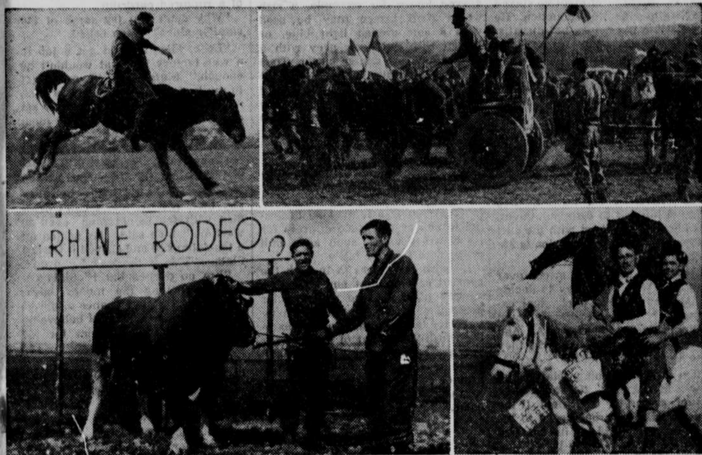
Taking time out during the march through Germany, personnel of the U. S. army stage a rodeo for the entertainment of fellow G.I.s. Busters and riders from New York City competed with range hands from Texas. Almost every part of the country was represented. Entertainment of this type, officials say, does much to build the morale of the fighting men. This is one of the reasons that the spirits of American soldiers has always been the envy of all countries.