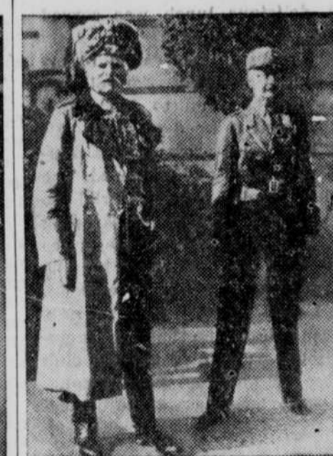
Prince August Wilhelm, right, younger son of the ex-kaiser, and Field Marshal August von Mackensen, who have been captured by the Allies.