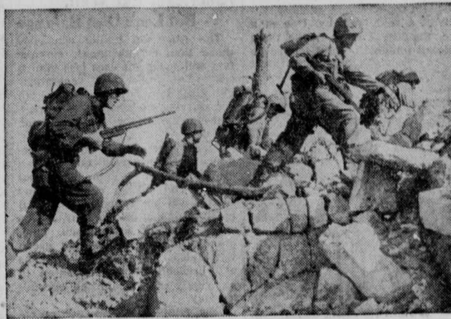
Equipped for any emergency, marines who landed at Okinawa hurdle a stone wall as they push across the island. First phase of the operation brought little opposition, the invading forces were quick to grasp the opportunity, and the early assault waves drove to the interior of the island shortly after they hit the beach. Strong opposition came later.