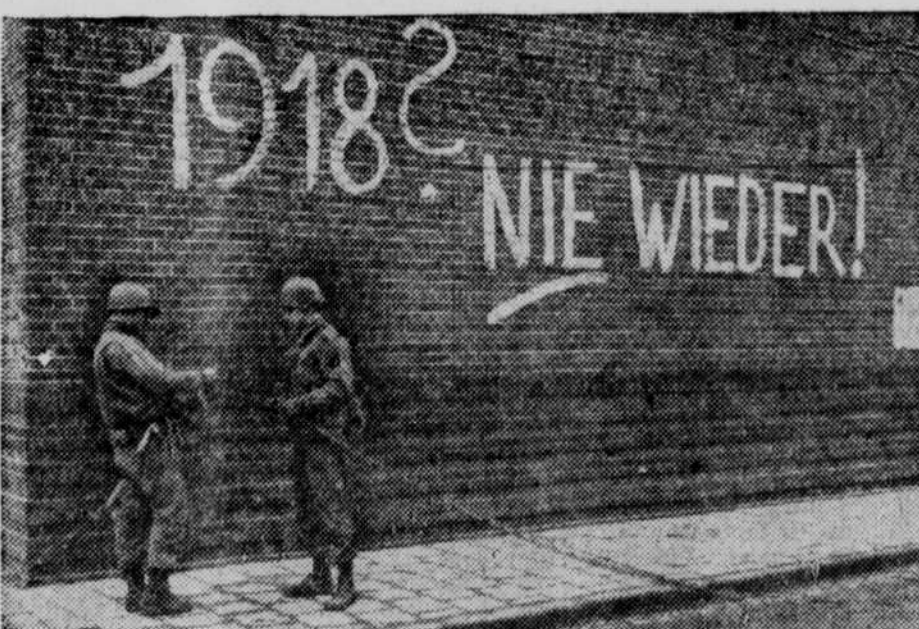
U. S. 9th army signalmen repair wires while standing under a sign painted by Germans as part of a propaganda program in Echt, Holland. Translation: "1918? Never Again." The Allies have pledged themselves to this slogan—that never again will a peace be made that will permit Germany to conduct another world war.