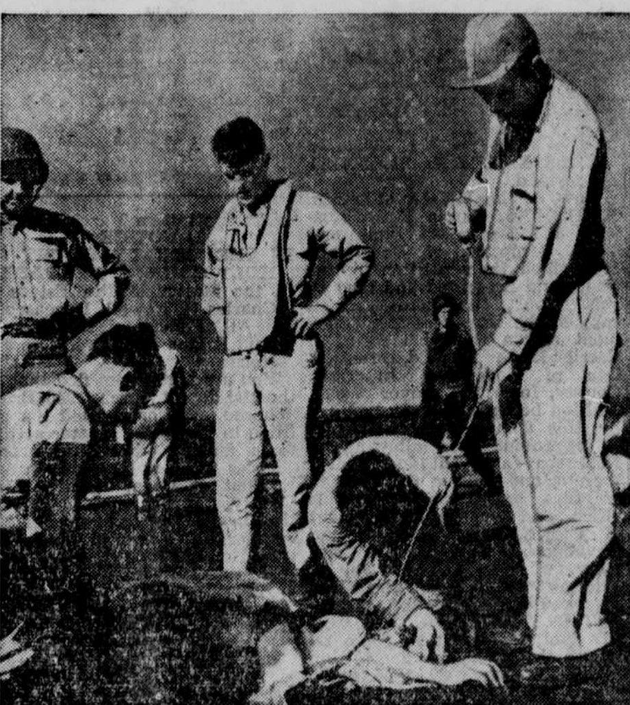
Wounded by a Jap bomb hit on a navy carrier, a navy officer is given a transfusion on the deck of the warship by fellow officers, somewhere in the Pacific. On-the-spot transfusions, such as this one, have saved the lives of countless servicemen in this war. The collection of this blood is only one of the many ways in which the Red Cross is serving.