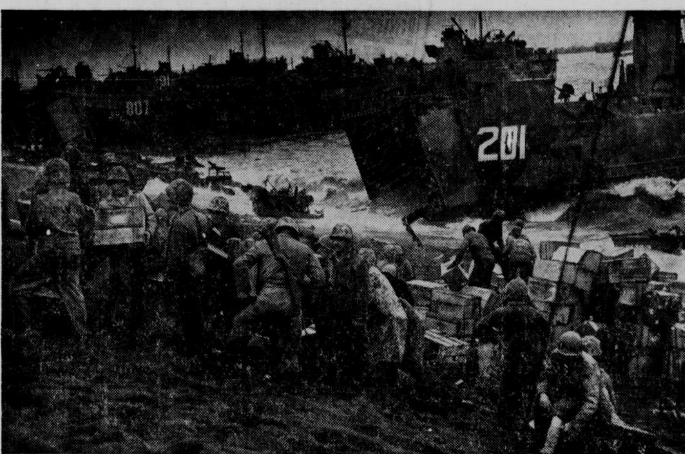
Photo, just received, showing that out of the gaping mouths of coast-guard-manned and navy landing craft rose the great flow of invasion supplies to the blackened sands of Iwo Jima, a few hours after the marines had wrested their foothold on the vital island in the front yard of Tokyo.