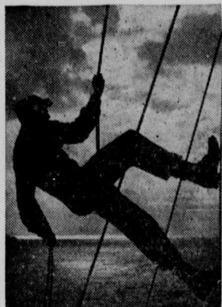
Army mountain trooper keeps in trim on passage overseas. He goes aloft in practice to keep sharp for altitudinous action up the cliffs and peaks on European battle fronts. Agility from long training in session of "Rappelling" is shown.