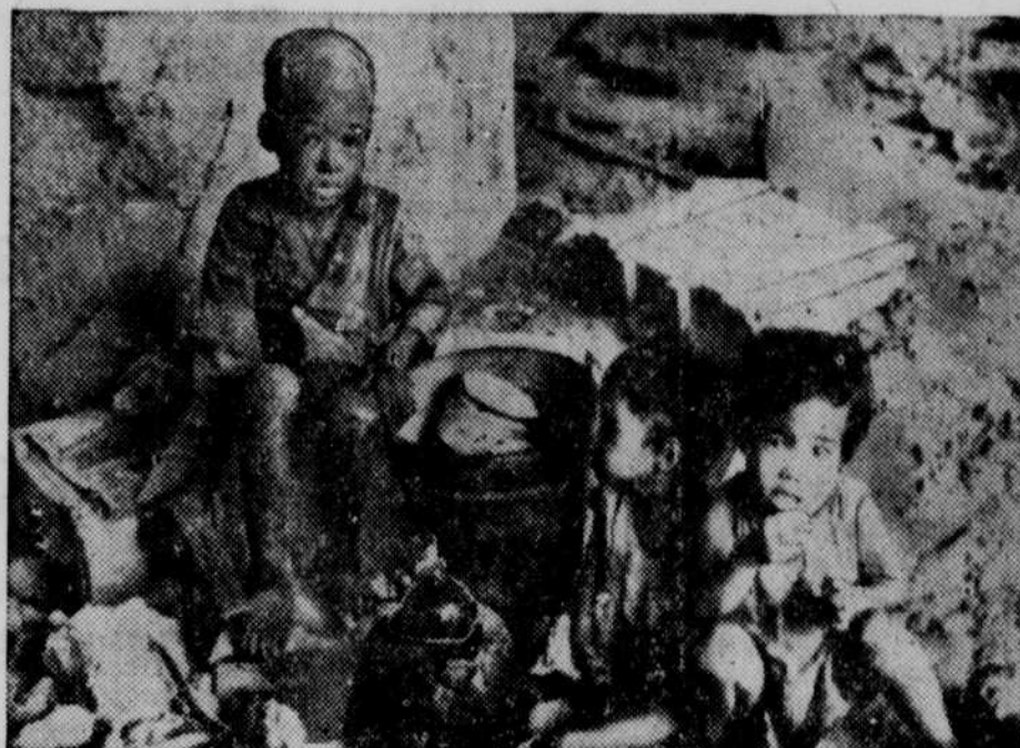
These Filipino children huddle in the debris of war left in the wake of the American and Nip fighting, and are shown bleeding and ill from lack of food and shelter. They were cared for by the liberating Yanks, after the Japanese garrisons in the city had been wiped out. All children showed lack of proper nourishment.