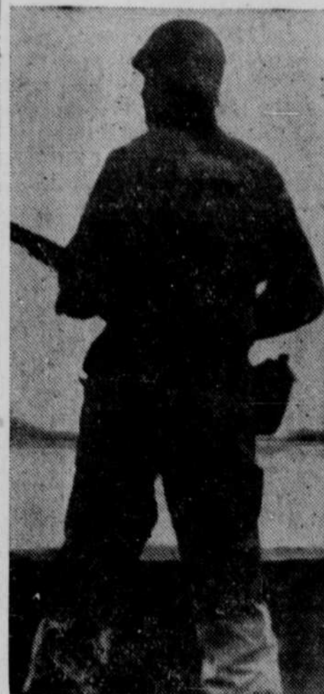
A 9th army combat infantryman, the 1945 version of Germany's historic anthem. The wrecked Dusseldorf bridge acts as lookout station. Soon after this picture was taken the G.I. and his unit moved forward into German territory with advancing armies.