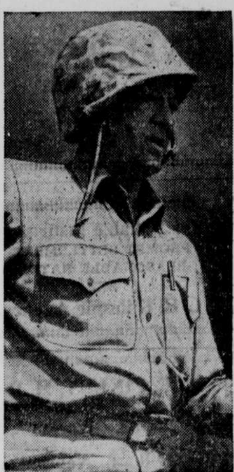
Maj. Gen. Graves B. Erskine, commander of the 3rd marine division, shown outside his quarters while directing his division's part in the capture of Iwo Jima. His unit has been making history in the Pacific, as one of the hero divisions of the war.