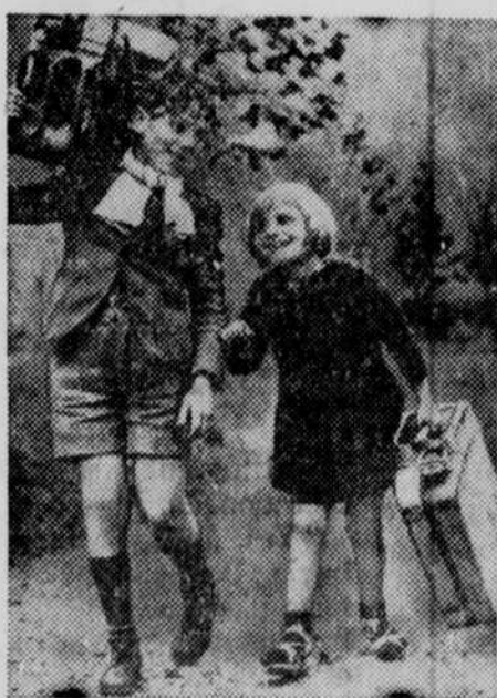
These two French children are on their way to an American salvage station with two gasoline cans. More than a million of these containers have been returned by French children.