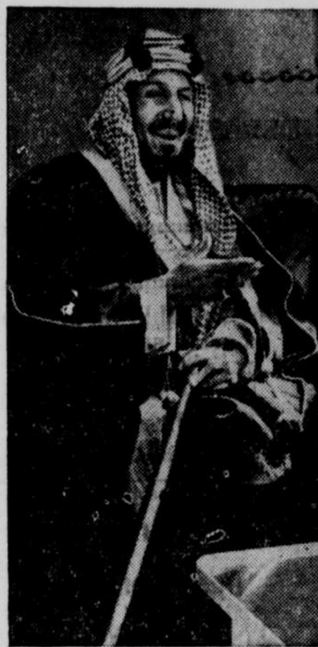
King Ibn Saud of Saudi Arabia, is shown aboard an American warship, anchored at Great Bitter Lake, Egypt, when President Roosevelt was host to three kings during a halt there after the conference at Yalta. Emperor Selassie and King Farouk were also present.