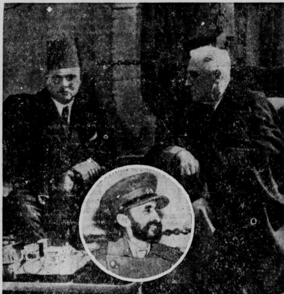
President Roosevelt has a friendly talk with King Farouk, (in admiral uniform), of Egypt, aboard a U. S. warship near Cairo, and with Haile Selassie I, emperor of Ethiopia. The result of the Big Three conference was explained to these rulers. Other visits were scheduled by the President before his return to the United States.