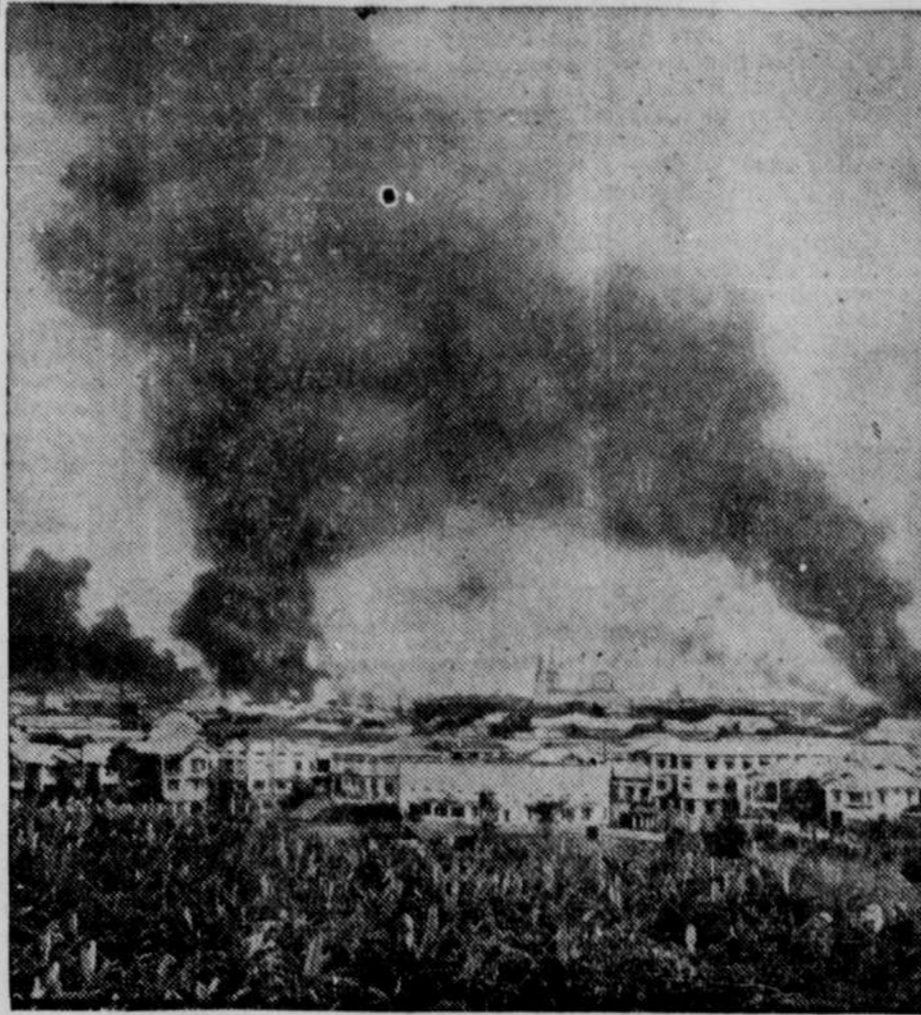
Fires that may continue for weeks have been set on Luzon island. In the city of Manila, a large part of the city will be in ruins before the American forces can get the flames under control. Many of the Japs are still hiding in the city, setting new fires in various locations.