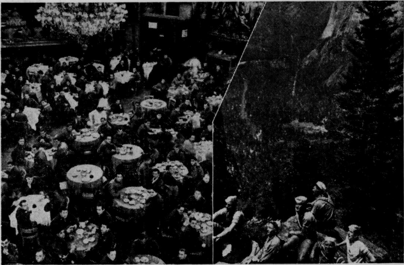
Shown above, the dining room of the Paris Grand Hotel, which has been turned over to the furloughed fighting men enjoying time out in Paris. Many convalescent sailors are being sent to Yosemite National park, California. The Ahwahnee Hotel, a tourist resort operated by the interior department, has been taken over by the navy and used as a convalescent hospital.