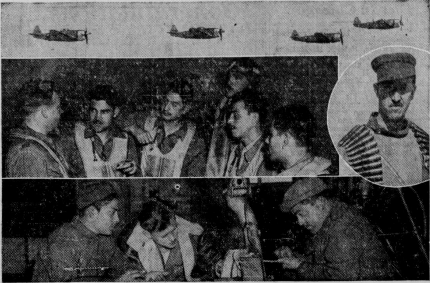
Photo above shows a group of Mexican aviators, who have been trained with lend-lease funds and are getting ready to move to the front to do their part against the Axis. This will be the first aerial squadron from Mexico to enter combat as well as the first Mexican air unit to finish training in the United States under lend-lease. They are shown in the air as well as on the ground, where they studied mechanical operation.