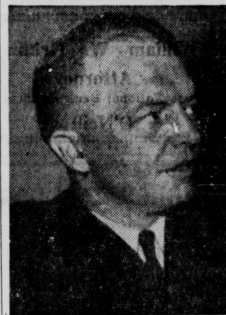
Comdr. Harold E. Stassen, former Republican governor of Minnesota, who was named by President Roosevelt to the United Nations conference at San Francisco. He was recently decorated for his naval work.