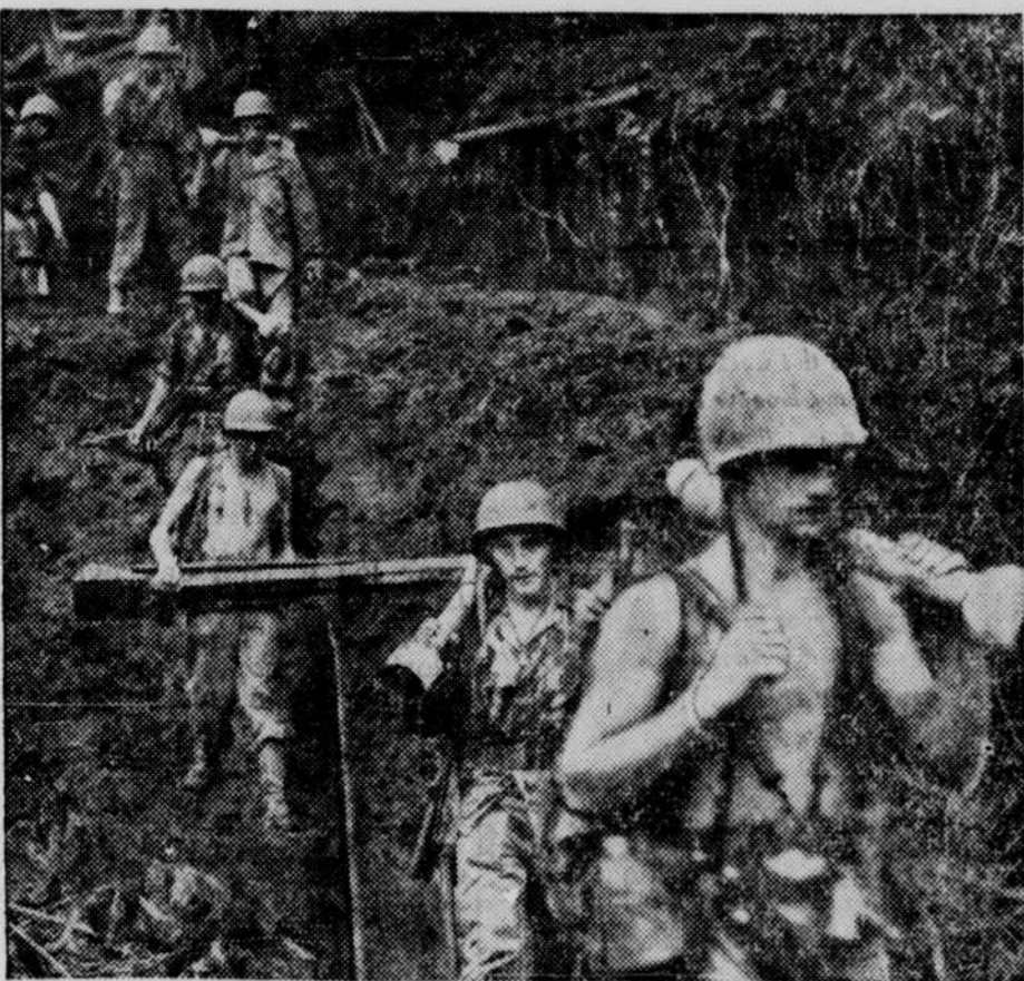
Members of a marine rocket platoon tote their equipment over rough Bougainville terrain to the front lines. During this campaign, the first in which land based rockets were used, both rockets and portable launchers were transported in much the same manner that machine guns are moved into position during landings. A feature of these rockets is that they do not require a solid base from which to be fired.