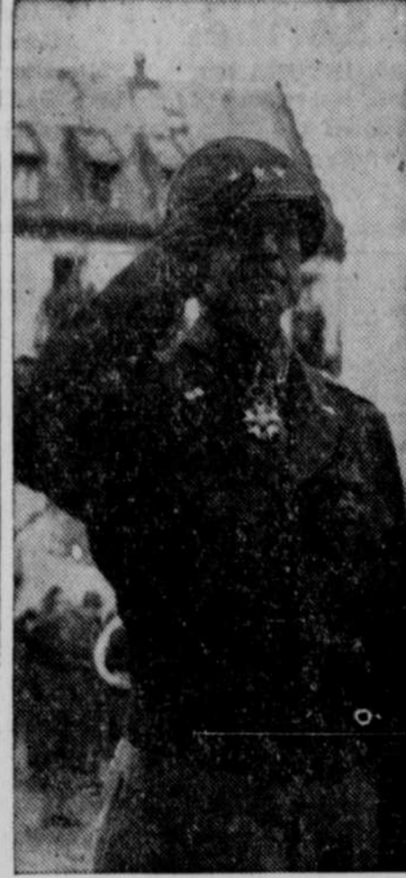
Lt. Gen. Alexander Patch, commander of the 7th army, is shown after being decorated by Gen. Charles de Gaulle with the cordon of a Commander of the Legion of Honor and Croix de Guerre with palm, at Saverne, Alsace, France.