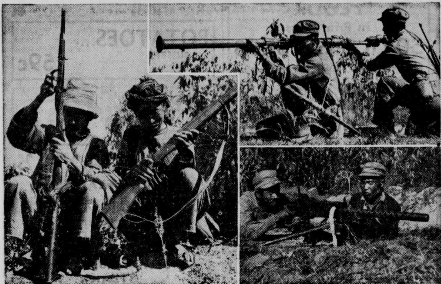
Led by American army, navy and marine officers and enlisted men, the Kachins, perennial hill people of Burma, are focusing their natural fighting talents on combating the Japanese behind enemy lines in Burma. Known as the American Kachin rangers, the Kachins have contributed greatly to the defeat of the Japs in Burma during the last two years. The activities, until recently, have been withheld.