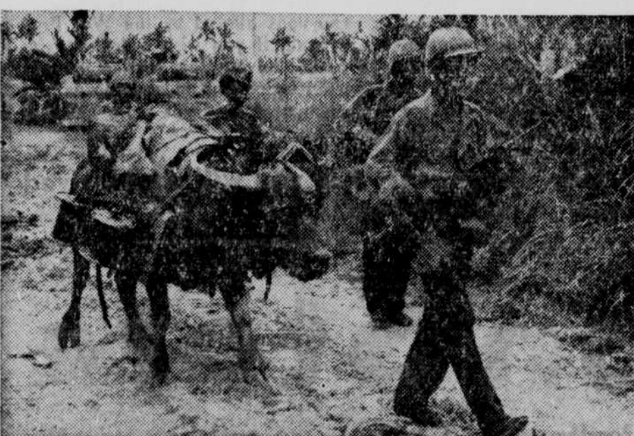
Veteran signalmen of the Seventh division on Leyte give high praise to water buffaloes as pack animals, but have a serious grievance regarding other habits of these sturdy beasts. Herds, roaming freely in certain areas of the island, frequently disrupt communications by getting tangled in signal corps field wire, laid off roads to avoid tanks.