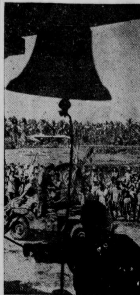
While Filipino residents of San Fabian cheer a passing American jeep, a small boy rings the ancient bell of the ruined municipal building. This building had been converted into a strongpoint by the Japs and as a result was the target of U. S. navy guns.