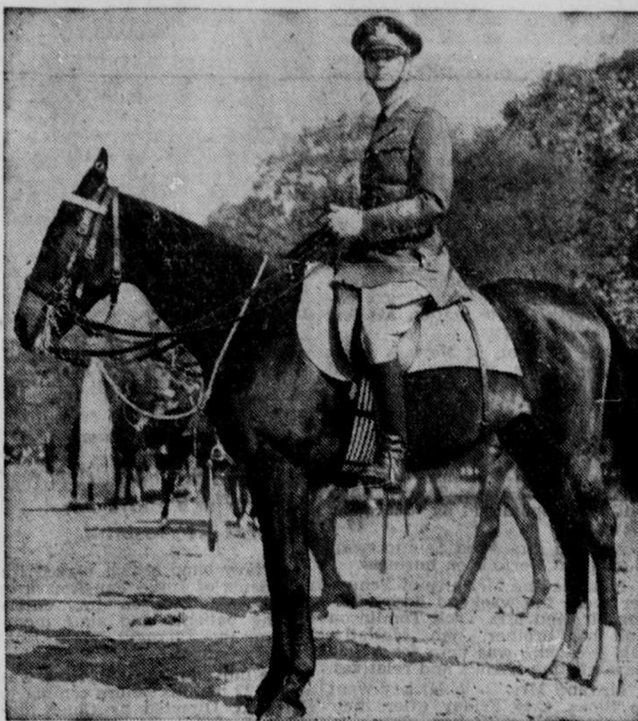
With the departure of Gen. Douglas MacArthur from the Philippine theater of war, Lieut. Gen. Jonathan M. Wainwright was left in charge of troops in besieged Bataan. He had formerly commanded the First U. S. cavalry. His old unit led in the recapture of Manila. It is believed that General Wainwright is a prisoner in Japan or Formosa. Photo was taken while General Wainwright was in the cavalry.