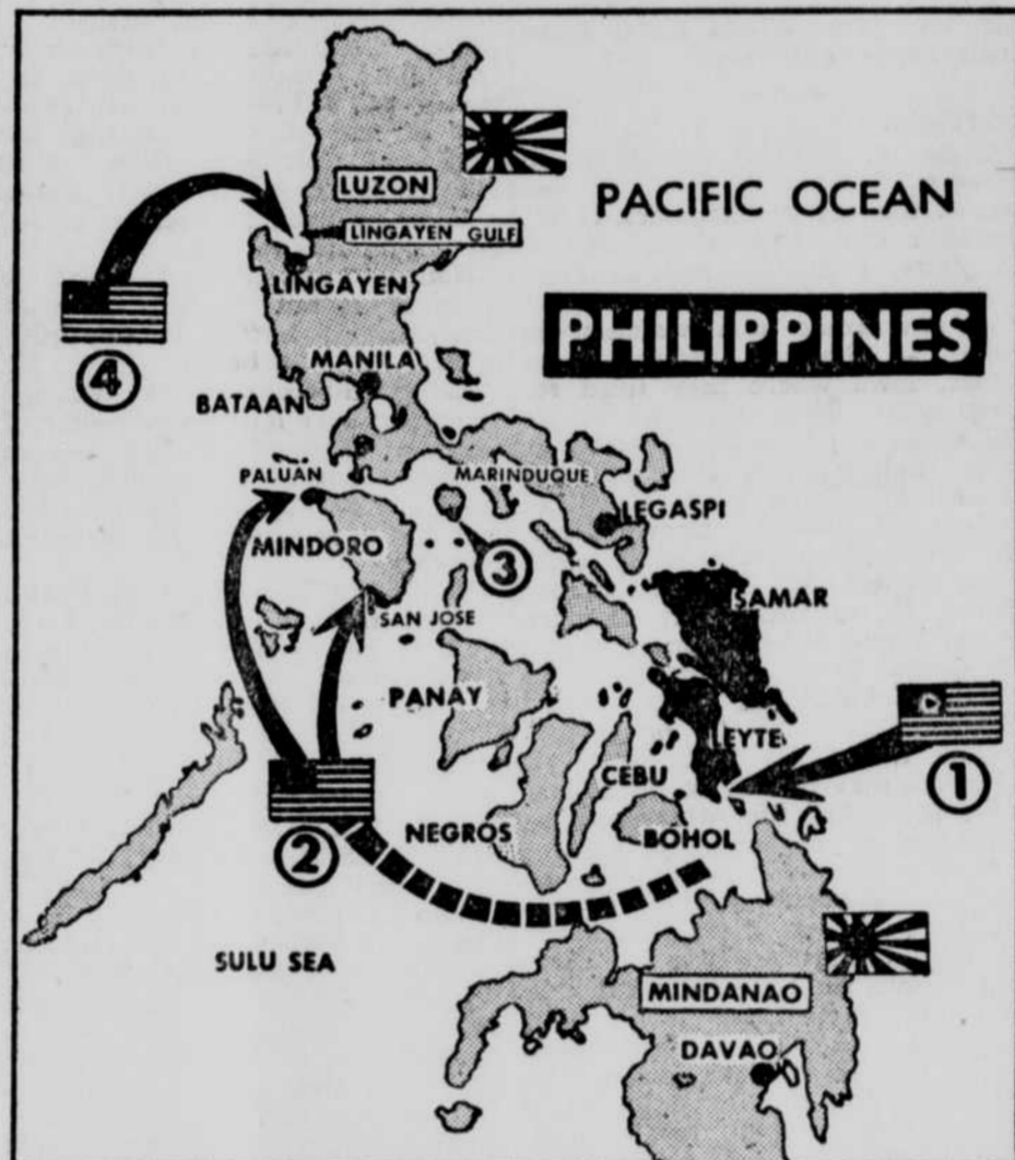
Landings on Philippines, (1) at Leyte, (2) Mindoro, (3) Marinduque, and (4) Luzon, most important of all the islands. Just two years, eight months and four days after the fall of Corregidor, American troops are back to retake the entire island.