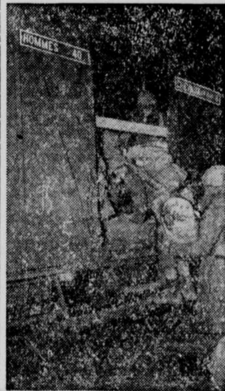
Reminiscent of World War I days, these American infantrymen board a "40 Hommes, 8 Chevaux" box car in France. They are members of 302 Reg., 3rd Bn., 94th Div. Many of the American troops were moved by these box cars in World War I. This is the first photograph received during present war.