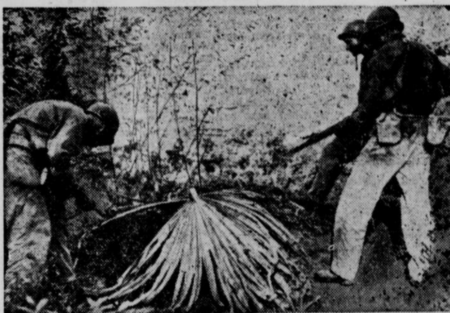
Cautiously, troopers check a Japanese pillbox facing the road to the town of Manao, on Luzon island in the Philippines. Little opposition was met with from the pillboxes or other Japanese fortifications captured by the Americans after their landing on Luzon. Navy big guns had done their share in softening up landing areas.