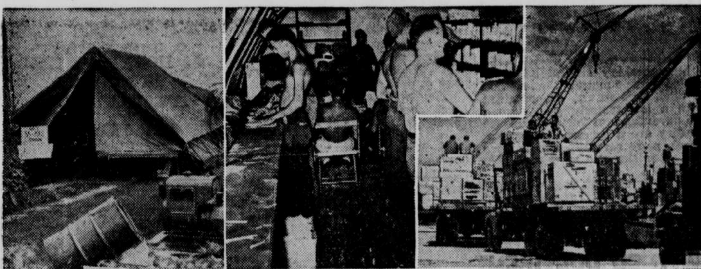
V-mail handling has become one of the best organized and most important branches of the service. Lower, V-mail combat film exchange. Upper left, temporary sending station in the field. Center, outgoing V-mail casing operation. Upper right, loading V-mail gear at Pearl Harbor. Wherever Uncle Sam's boys are to be found, V-mail will reach them. Officials urge more extensive use of this service.