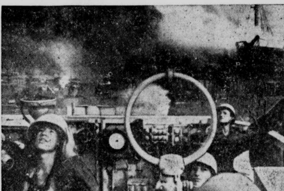
All hands on the rescue boat are at their posts, ready for a new Jap attack, as they stand near the flaming LST. Cargo, tanks, trucks, jeeps and other material are now a mass of flames, but the invasion fleet moves in as General MacArthur's men spread out to retake the Philippines from the Japanese invaders.