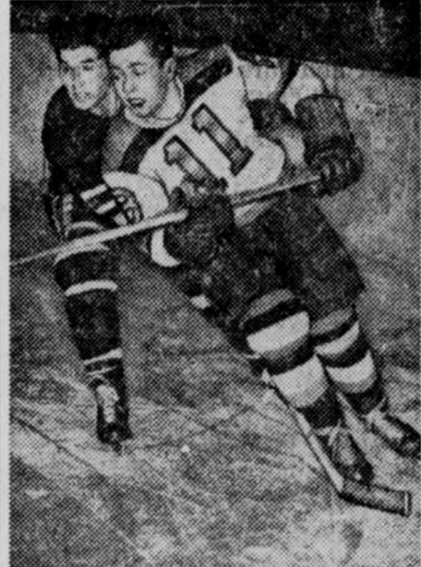
Speed on ice is shown as Bill Bupolo, No. 11, of Boston Bruins, outskates Butch McDonald of Black Hawks during game at Chicago. The Chicago Black Hawks won 4 to 1.