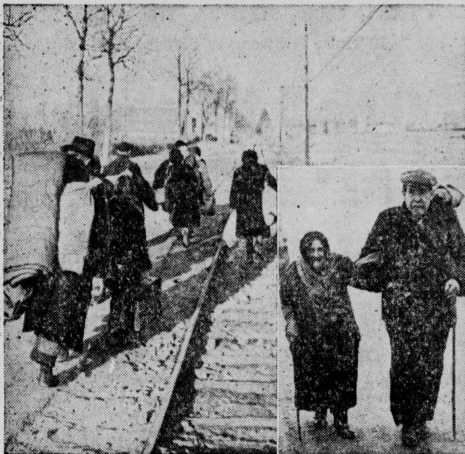
Carrying their few belongings, Belgian civilians trudge wearily along a road from the path of an advancing German army (left), and return (right), after the American armies have repelled the attack of the Nazis. Thousands of Belgians are without homes and many are in serious condition from privations.