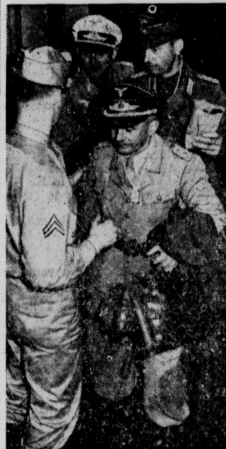
Recently arrived from Europe at port of Boston, these German officers are being given back their personal belongings. They are being assigned to permanent prisoner of war camps in the United States for the duration.