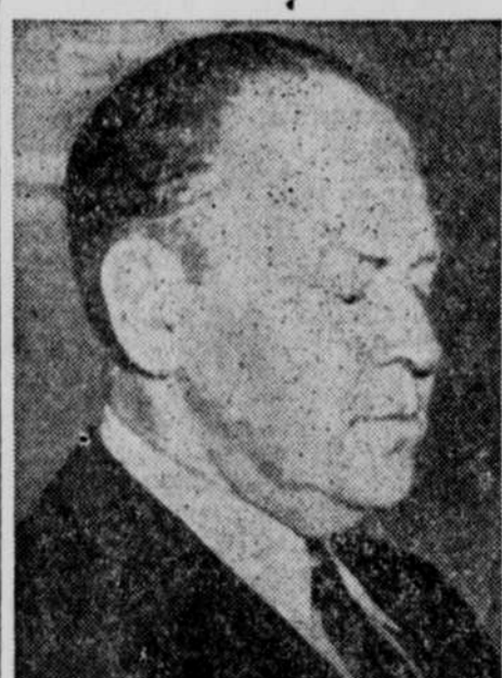
Rep. Edward J. Hart, (N. J. Dem.) who voted against new house committee on Un-American activities, has been appointed as chairman of the new committee.