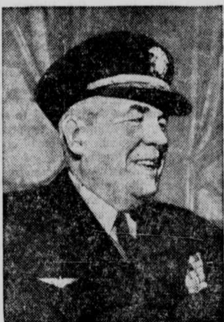
That New York and other cities will soon be targets for German robot bomb attacks has been predicted by Rear Adm. Jonas H. Ingram, C.G. Atlantic Fleet.