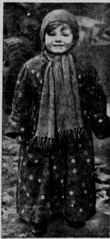
This youngster of Bastogne has no ambition to be a Beau Brummell. All he is interested in is getting and keeping warm, so he is perfectly happy wrapped in this hand-me-down outfit and oversize muffler furnished from relief quotas.