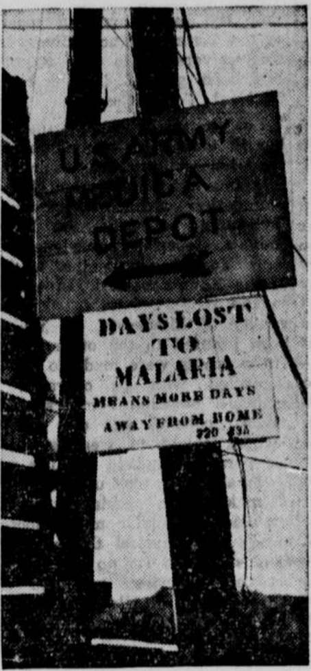
This warning by medical units of the 12th air force bomber base emphasizes malaria control on the island of Corsica. The swamps are sprayed from air and land and the newest control methods are put into practice.