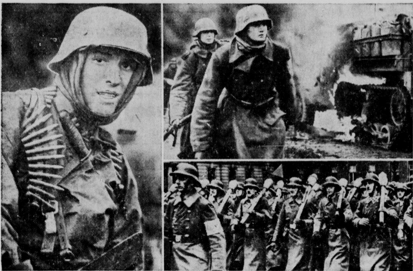
Left, a Nazi soldier, heavily armed, typical of men facing our armies on German front. Upper right, German troops file past a burning American tank. Lower right, armed with antitank weapons, on the style of our bazooka, units of the Volksturm parade in Berlin. These photos were captured by American soldiers.