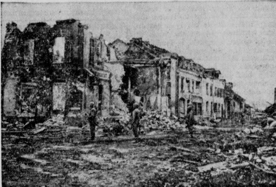
There have been hundreds upon hundreds of scenes like this in war-torn countries over which the Germans have rode roughshod, but this one is different. This is Germany—the same Germany which has dealt death blows to every country in Europe—now having war brought to its own door, in the city of Saarlautern.