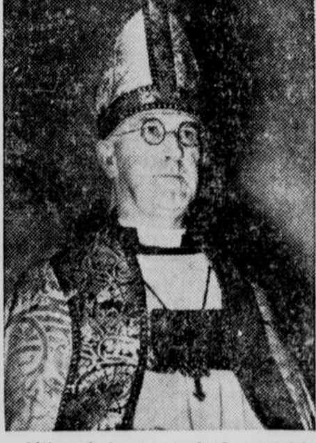
Although he never had a parish, the Right Rev. Geoffrey Francis Fisher, Bishop of London, has been named Archbishop of Canterbury, highest office in the Church of England.