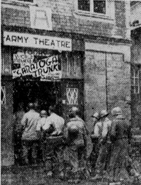
U. S. servicemen are shown entering a show to see "Saratoga Trunk," in a section recently taken from the Germans. The USO has been able to keep the shows moving to the front, as the troops advance into Germany.