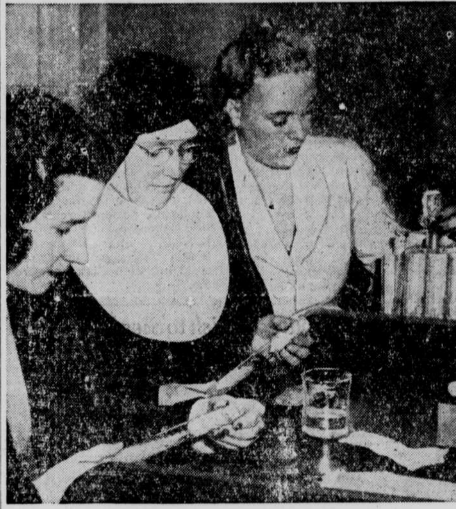
Penicillium notatum molds are inspected and crated at St. John's university, Brooklyn, N. Y., preparatory to shipment to the U. S. medical corps in Italy. From this mold pure penicillin will be developed and extracted by our medical corps for the treatment of the war wounded on the various European fronts.