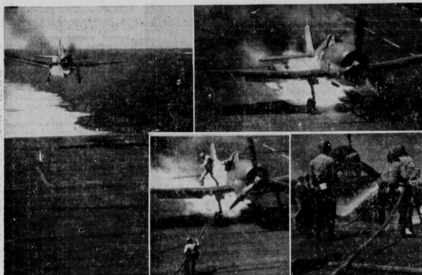
Quick action by navy fire fighters saves flaming plane and pilot. Like a meteor, a navy F6F burst into flames (as shown at left) as it approached its carrier, the USS Cowpens, in the Pacific. Upper right, shows the plane as it landed. Center, shows pilot leaving the burning plane. Lower right, the fire is out, with no damage to carrier.