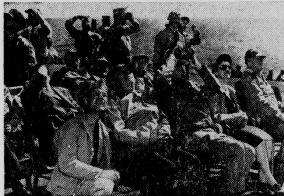
From the deck of a carrier, members of congress visiting the Pacific area observe the accuracy of navy gunners. In the center of the front row, peering through binoculars, is Adm. C. W. Nimitz. At his right is Congressman J. J. Heffernan of New York, and at his left is Congresswoman Margaret C. Smith of Maine.