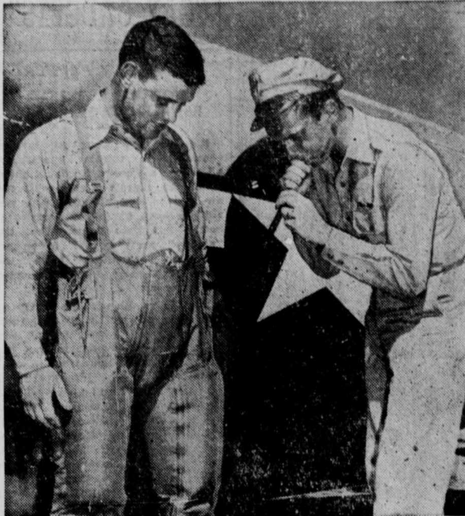
These pneumatic pants prevent U. S. fighter pilots from blacking out in aerial maneuvers by applying pressure to the pilot's abdomen and legs during a pullout or turn, preventing the blood from pooling in the lower extremities and aiding the heart to maintain circulation to the brain. They are inflated by lung power or by mechanical devices. Many civilian accidents as well as military resulted from blacking out. The new pneumatic pants will largely do away with the condition, often fatal in war as well as peace.