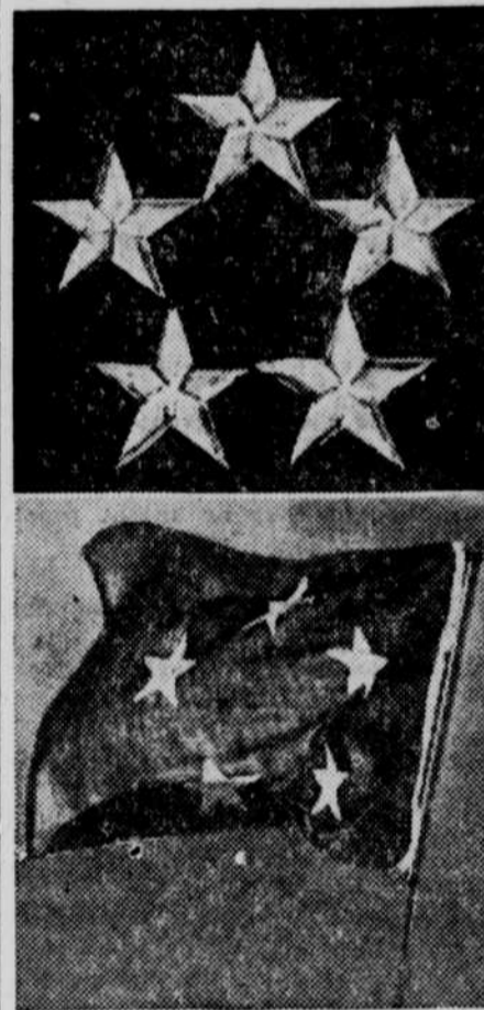
Pictured above is the five-star insignia to be worn on the shoulders of Generals Marshall, Arnold, Eisenhower and MacArthur, denoting their rank of "General of the army." Below, the five-star flag of Fleet Admiral Ernest J. King.