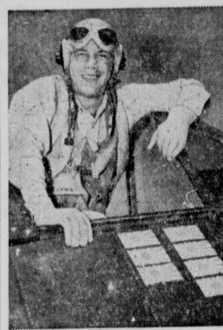
Lieut. Bert DeWayne Morris USNR, better known to movie fans as Wayne Morris, is shown in his Hellcat following a series of missions in which he shot down several Jap planes. He has been reported several times in dispatches from the Pacific.