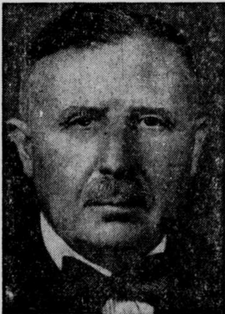
Eduard Von Steiger, above, former member of the Swiss Federal Council, was recently elected president of Switzerland for 1945. He belongs to the Farmers' party.