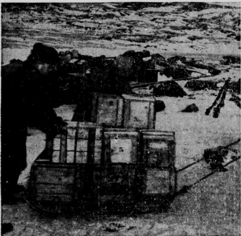
On an isolated stretch of northeast Greenland, U. S. coastguardsmen surprised and captured a German radio-weather station, last enemy outpost in Greenland. A 183-foot Nazi trawler and its crew was also captured in nearby waters. Above shows coastguardsmen moving captured radio supplies.