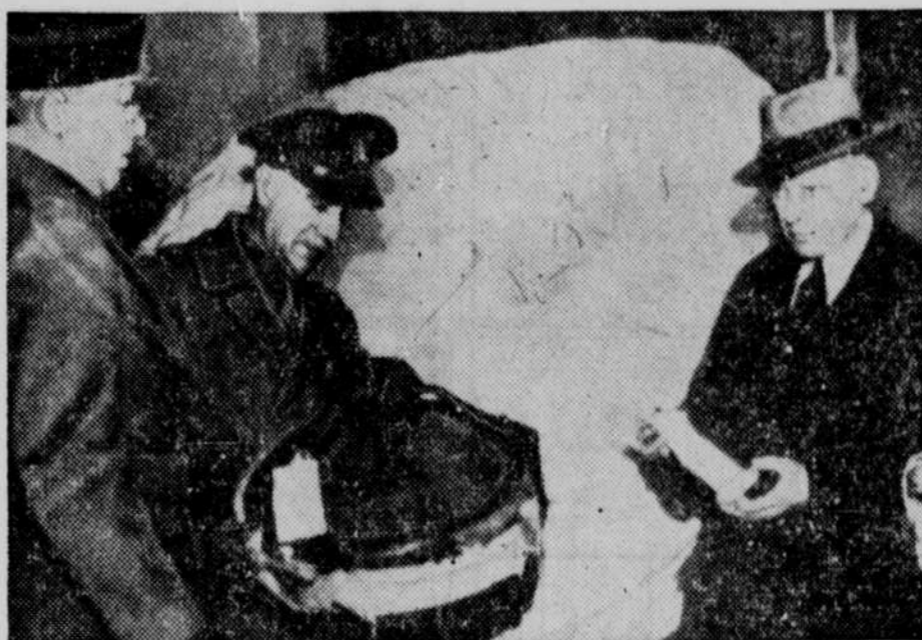
Army officers and an agent of the FBI are shown here with parts of the Japanese balloon found recently in Montana. They are holding parts of the base of the balloon. Its explosives failed to go off. Another mysterious balloon was reported drifting inland from the ocean over Santa Monica, Calif.