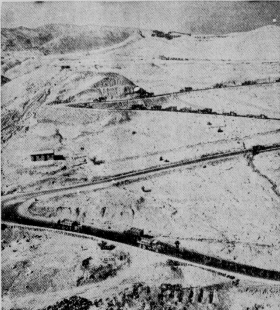
More than 4,380,440 tons of war implements and goods from America's factories to Russia, have been shipped through the Persian Corridor. The goods are sent by rail and truck across some of the most varied and difficult terrain in the world. This is the only theater where the Russians, British and Americans are fighting together.