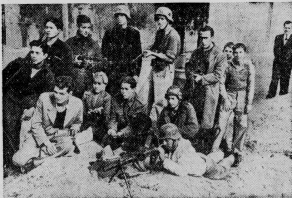
Elas troops with machine guns and rifles are shown in the streets of Piraeus, where British and Greek mountain brigade forces extended their holdings despite local Elas attacks. The drive of the leftist Elas forces on the center of Athens appeared to have been halted and the most dangerous phase in turmoil evidently passed.